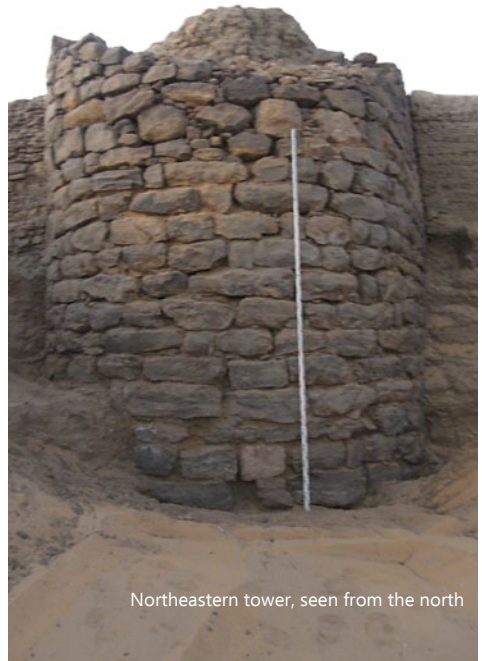
Northeastern tower, seen from the north

Thus reinforced, the citadel remained the residence of choice of the rulers of the late Kingdom of Dongola Town, which existed from the end of the 14th through the 17th century. A new circuit wall was constructed in the northwestern corner of the old rampart, near the corner bastion, on top of the ruins of the Pillar Church (PC). New constructions can be presumed to have been constructed also in the northern and eastern parts of the citadel.