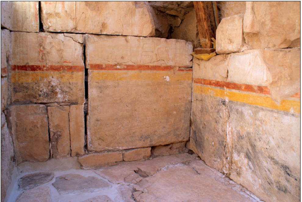
Fig. 4. North wall of niche A and the displacement of the dado band in the northeastern corner

Vestibule. Assuming that the foundation and successive courses of blocks in this wall were originally horizontal, it is evident that the wall structure had settled toward the north. The footing has been recorded as falling approximately 2.5 cm every meter of its length, giving a total of about 12 cm across the entire length of the southern part of this wall. This process had the effect of deforming the decoration of niches in the Vestibule and is reflected in the directional shifting of the blocks. The dado rail in the northeastern corner of niche A is displaced between the north and east walls of the niche by approximately 8.5 cm [Fig. 4]. The west wall also reveals two vertical separations of blocks on the full preserved height of the wall [see Fig. 3]. Starting from the southern corner, one can