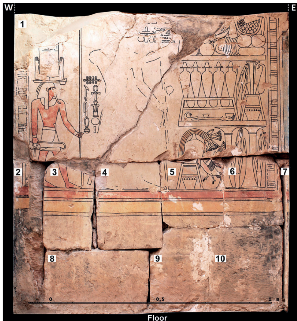
Fig. 2. North wall of niche B (Egyptological interpretation M. Barwik, drawing M. Caban, A. Stupko, M. Puzskarski)

Cracks are occasionally seen through whole blocks, visible also in neighboring halls wherever the walls are just one block thick and decorated on both sides. The biggest deformations are observed currently on the north wall of the niche [Fig. 2].