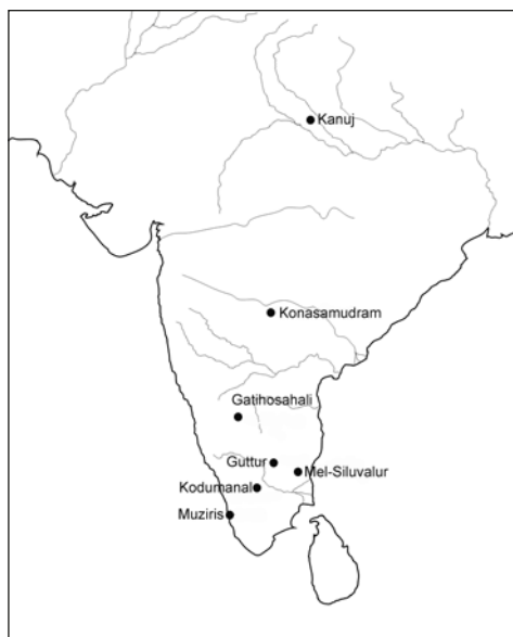
Fig. 2. Main sites of confirmed crucible steel production in India discussed in the text (Drawing J.K. Rądkowska)