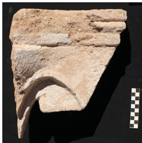
Fig. 11. Corner of a “Nabatean” capital of the Nea Paphos II type