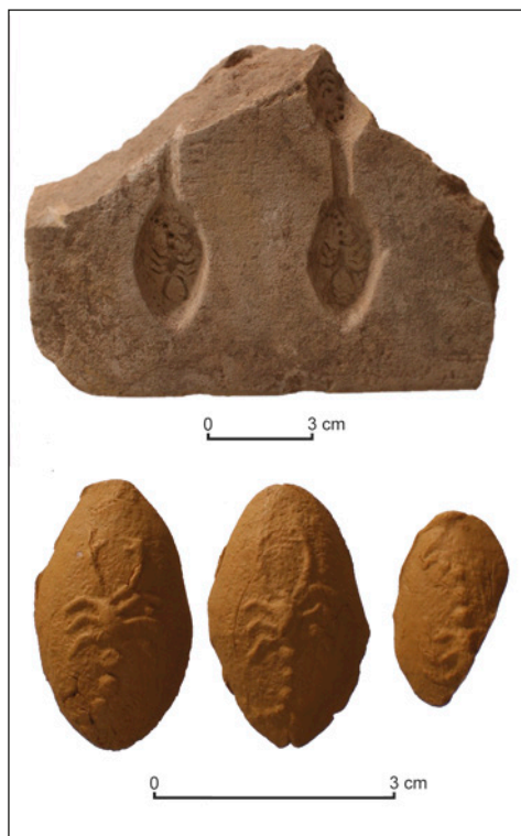
Fig. 10. Molds for sling bullets decorated in the form of a scorpion in relief; bottom, impressions of sling bullets in clay

it seems that not only the western side with Corinthian capitals, but possibly also the northern one with “Nabatean” capitals were much higher, a minimum of over 5 m, if the standard proportions of the Corinthian order were to be accepted.