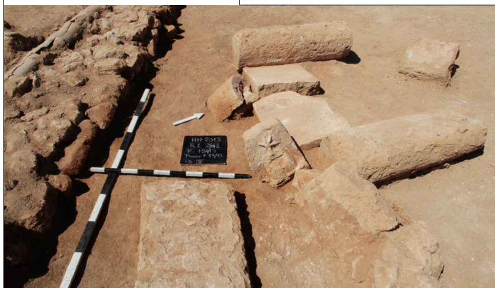
Fig. 5. Acroterium with symbols of the Dioskouroi: pilos and star; below, the acroterium found in situ

The hydraulic floor, remains of which were found in northwestern part of the courtyard in 2011, was also situated well above the original floor of the courtyard, on the same level as the presumed western stylobate which bears evidence of the same hydraulic floor on its top. All traces of walls enclosing the basin, to which this floor belonged, are gone. Attempts to locate one on the southern side of the preserved stretch of floor made it clear that a cut, which separated this stretch from the western stylobate, damaged all traces also on this side [Fig. 8], and thus the original extent and function of the hydraulic floor remain unknown. The cut was filled with crushed plaster mixed with some soil resembling similar fill on the western side of the stylobate, that is, in portico 4, probably resulting from the dismantling of the remains of the “Hellenistic” House after its destruction in the quake in the