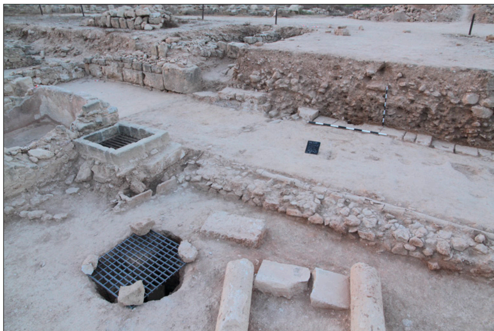
Fig. 9. Water installations in the southeastern corner of the main courtyard (1)

In the disturbed fill above the courtyard surface there were few finds of intrinsic interest apart from a mold for sling bullets with decoration in the form of a scorpion in relief [ Fig. 10 ]. Two joined bullets of this type were found in the Agora Project excavations. Four coins, two better preserved lamps and a small pawn of dark stone were also recovered. The rubble yielded numerous decorated architectural elements, including a series of fragments of “Nabatean” capitals of a variant