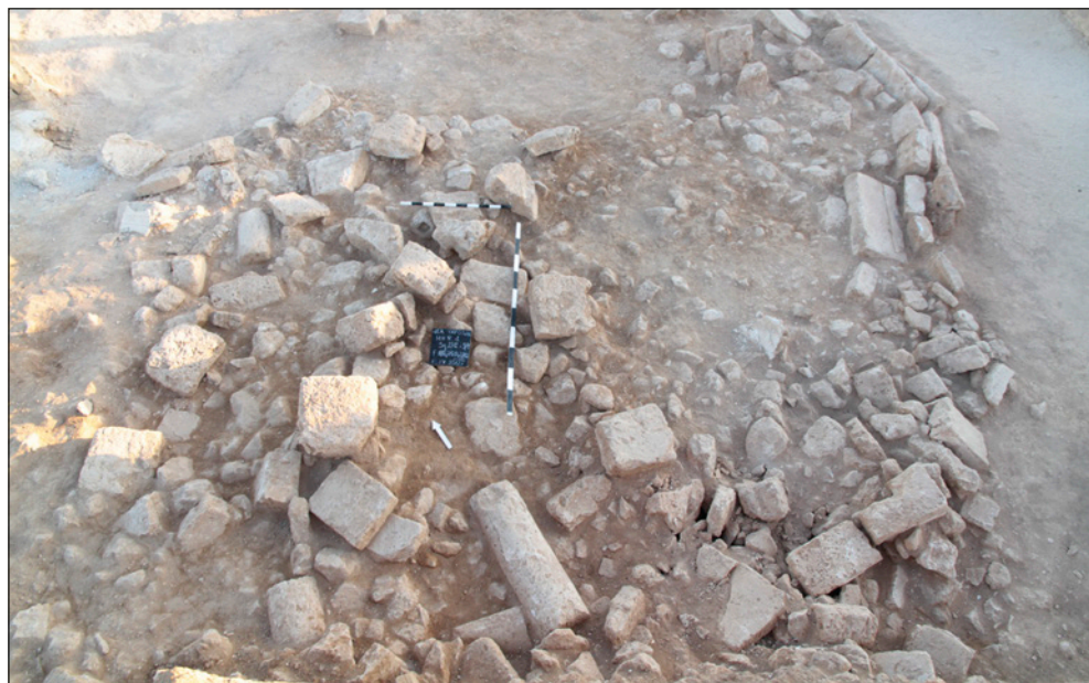
Fig. 2. Eastern part of the main courtyard of the “Hellenistic” House (1) and remains of the entablature of the eastern portico