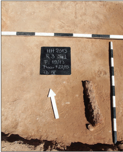
Fig. 6. Iron tube, probably hinge of large door leading from street A' to the southern portico (R.3)

2nd century AD. Relatively few pottery fragments included a base of Eastern Sigillata Hayes form 42 (Hayes 1985: 32–33, Pl. VI,4), Cypriot Sigillata form P40 (Hayes 1985: 88; 1991: 45, Fig. 36,6) and a handle of the Pseudo-Kos amphora “en cloche”, fragments of a “carrot” amphora (Hayes type II) (Hayes 1991: 91, Pl. 24,2, 93–94, Pl. 25,3; Reynolds 2005: 588, Figs 6–11) and other forms similar to those occurring in the destruction layer of the House of Dionysos.