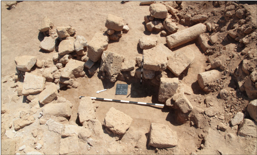
Fig. 4 Remains of pillars of opus africanum/incertum walls collapsed in the courtyard and partly disturbed by stone-hunting