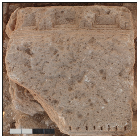
Fig. 12. Possible tholos lintel fragment