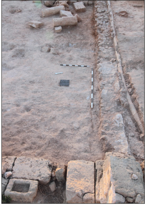
Fig. 3. Stylobate of the southern portico (R.3)

A coin (No. 1002) found under the collapsed block is of Hellenistic date, but pottery finds belong to the later 1st or early 2nd century AD, e.g., Cypriot Sigillata form P11/12 (Hayes 1985: 82–83, Pl. XIX,3–5; 1991: 40–41, Fig. 18,11–12).