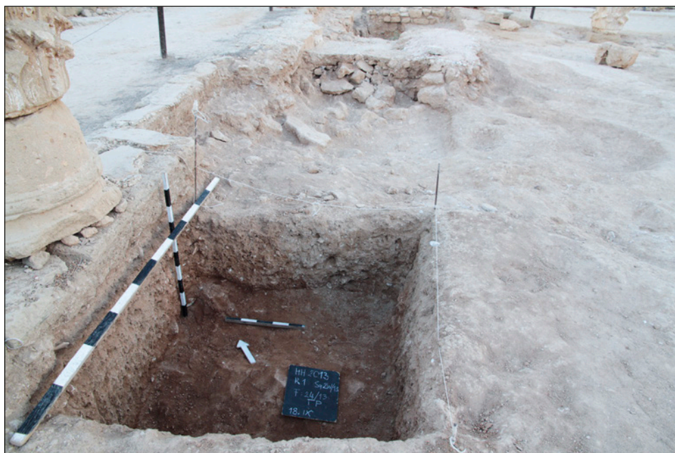
Fig. 8. Trial pit below reconstructed Corinthian column; in the background deep cut along eastern side of western portico stylobate, cutting hydraulic floor in the courtyard (1)

A settling tank and a pipe leading from the street A’ were situated along the western side of the well-head of the subterranean cistern uncovered in 1991 just west of the aboveground basin in the southeastern corner of this courtyard. The settling tank was built against a reused block (it is plastered on its western side), positioned north–south and included within the frame of the well-head. The pipe cut across the southern elevation of the building and through the southern stylobate foundation as well as the pipe running along it on southern side [Fig. 9]. A fragment of a pipe leading further north from the settling tank was found, but it was discontinued after just a single segment. It may have continued along the foundation supporting the basin