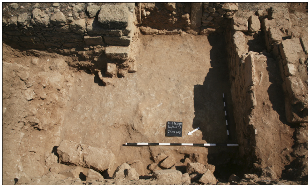
Fig. 11. Room 33 of the so-called Hellenistic House, situated below the southwestern corner of the Villa of Theseus