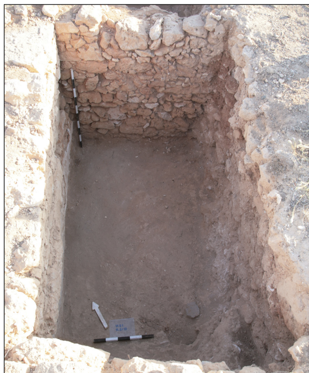
Fig. 3. Compartment 2 under room 1SW (Villa of Theseus), floor level with finds