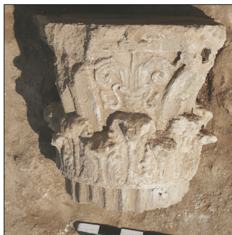
Fig. 12. Corinthian capital from the main courtyard of the 'Hellenistic House'

Above the final usage level of the courtyard, a Corinthian capital was uncovered, almost exactly matching one