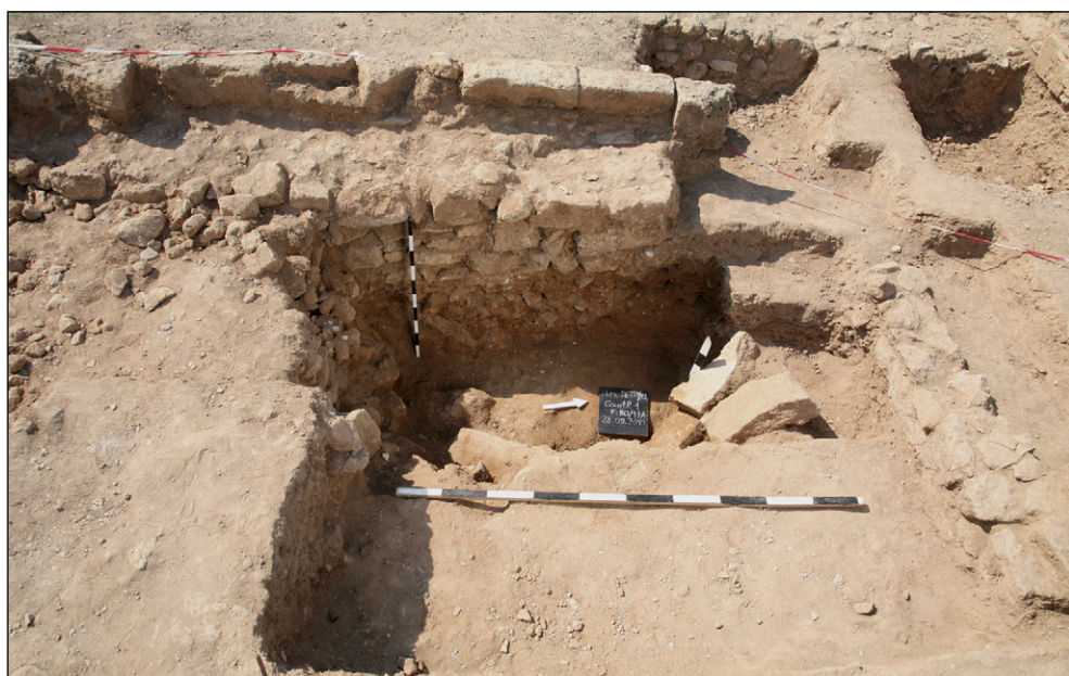
Fig. 13. Foundation of the stylobate of the western courtyard peristyle ('Hellenistic House'); note the shallow foundation and fragments of railing below

Apart from these main areas of exploration, limited cleaning for the purpose of rectifying the documentation was conducted in the eastern part of the so-called Hellenistic House. 2 One area was a threshold leading from street A; on the south, to a small courtyard 8E, and another was a hollow between rooms 8E and 15. Limited work was also undertaken in the Late Roman street between the Villa of Theseus and the House of Aion, and in room 7 of the latter.