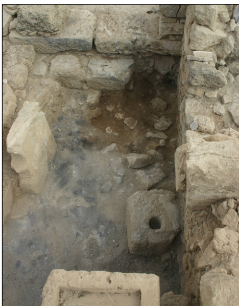
Fig. 7. Eastern part of heating area 32 with remains of thick ash and soot deposit abutting stairs leading to courtyard 13