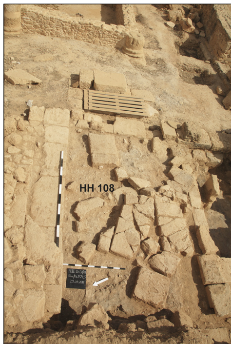
Fig. 9. Room 28S: lowest remaining level of disturbed pavement, wall and southern part of podium; southern and central part of courtyard 13 with remodelled tetrastyle impluvium in the background

The paving in room 28S (HH108), situated north of heating area 32, was very disturbed, most probably by an earthquake, with broken and displaced slabs resting in two layers and standing on end [Fig. 9]. A massive masonry wall north of this pavement, together with the south wall of stairwell 28N, supported a platform made of packed, medium-sized unworked stones (S.6/11) and accessible by steps. This structure seems to have supported