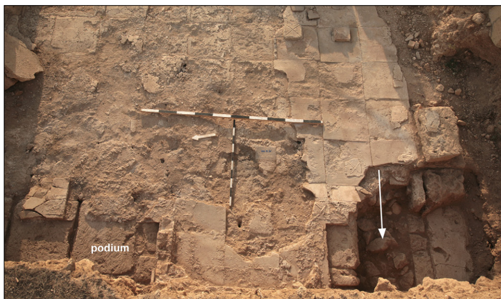
Fig. 2. Room 31 (Villa of Theseus) robbed out flagstone pavement under probable second podium