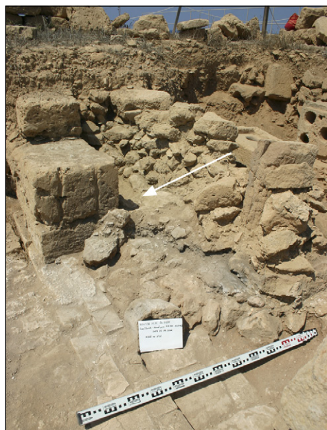
Fig. 6. Inside of a hot-air channel with ash deposit on the floor (arrow)