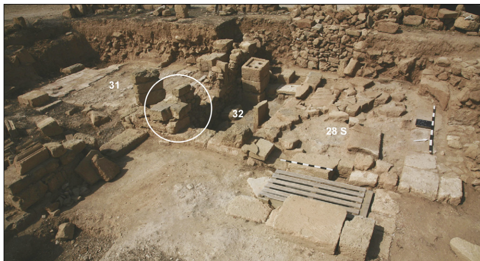
Fig. 5. Southwestern part of the so-called Hellenistic House with hypocaustic floor in room 31, heating area 32, and heavily disturbed pavement in room 28S