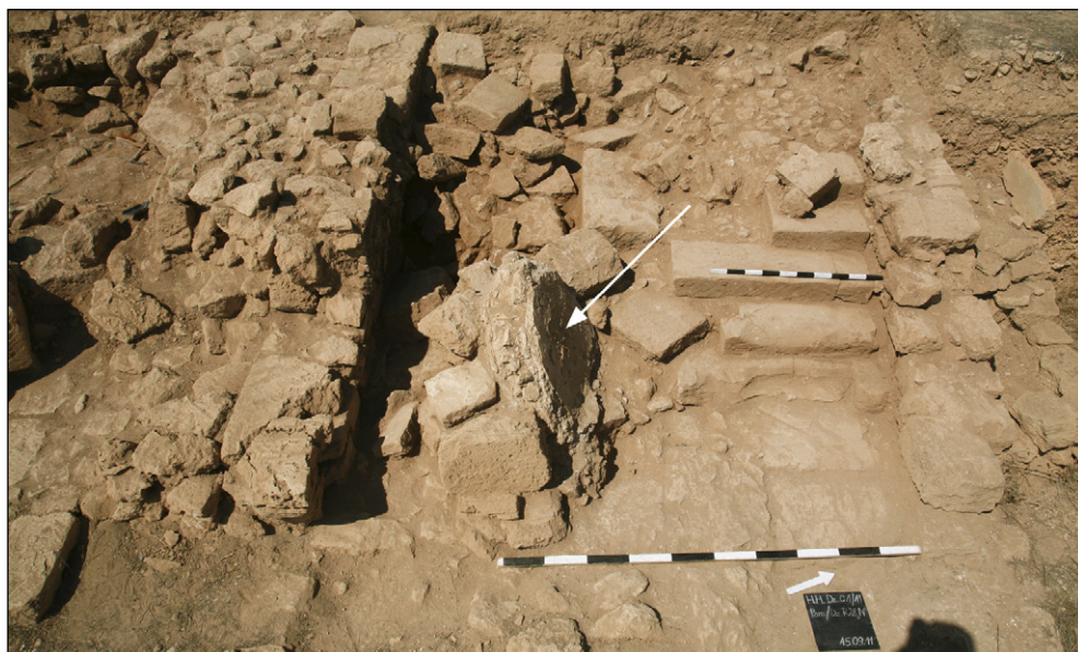
Fig. 10. Western staircase 28N with a fragment of collapsed basin floor tipped over from a podium south of it