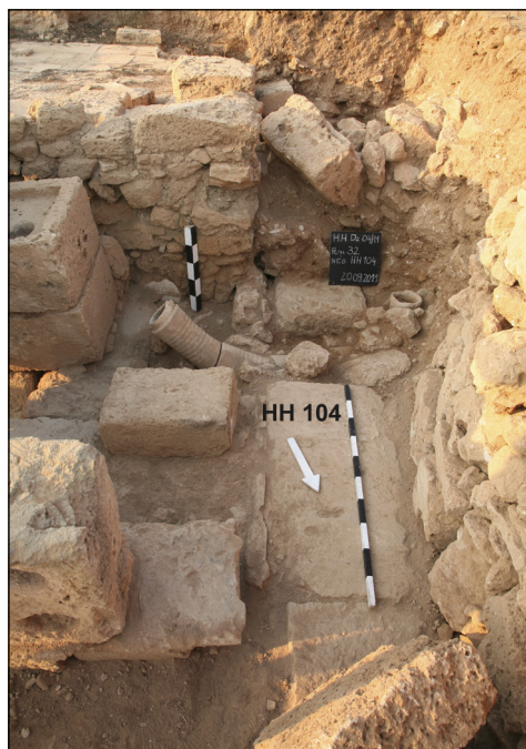
Fig. 8. Western edge of heating area 32: reused siphon and water pipes. In the background, a heating channel abutting the west wall of the complex, now dismantled

however, was not found. A source of heat located west of the building, in street 10, seemingly suggested by the direction of the channel, has to be ruled out, as the channel walls (HH102 and HH103) were clearly set against the west wall of the building (HH104, presently robbed out) rather than cut across it [Fig. 8]. At the eastern end of the channel, an oblique slit in a masonry pillar directed the hot air into the hypocaustic space of room 27. A previously entertained hypothesis concerning the existence of a vertical channel in this masonry pillar had to be abandoned, as the oblique channel proved to have a solid stone