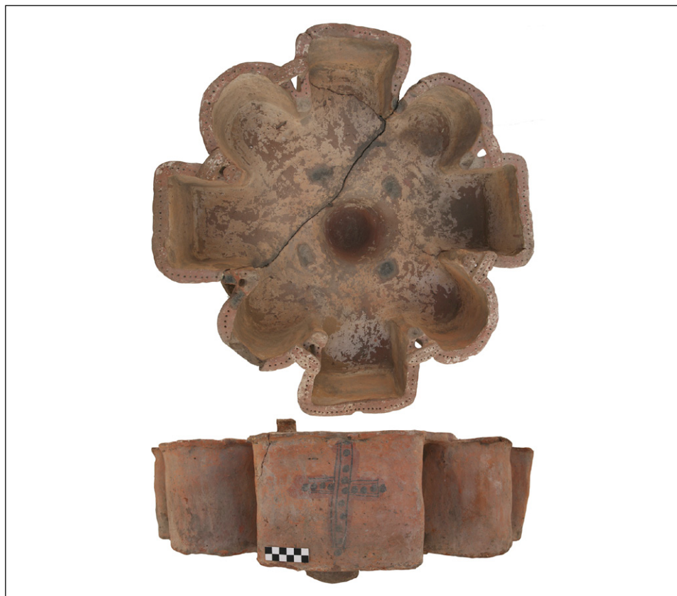
Fig. 7. Earthenware polylobed tray S1.117/2011

[Fig. 7], found 3 m east of the northern entrance to the latest church (in a layer of debris resulting from the destruction of the building). The paten had eight lobes and was 0.80 m in outer diameter. It was handmade of rather soft, porous clay, with a conspicuous carbon streak in the core. All the decoration of the paten, painted and impressed, was executed before the rather poor firing. Its general appearance fits the repertoire of Late/Terminal Christian handmade containers and it can be dated most probably to the 11th/12th