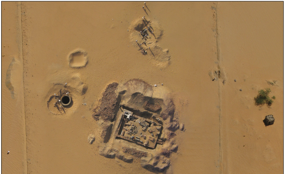
Fig. 4. Aerial (kite) photograph of the Selib 1 site taken in February 2011

In trial pit 11, which tested the west wall of the church, the wall of the earlier complex was revealed along with another wall parallel to it, set symmetrically with regard to the presumed western entrance. The space between both walls was paved with red brick (35 cm by 17 cm) and