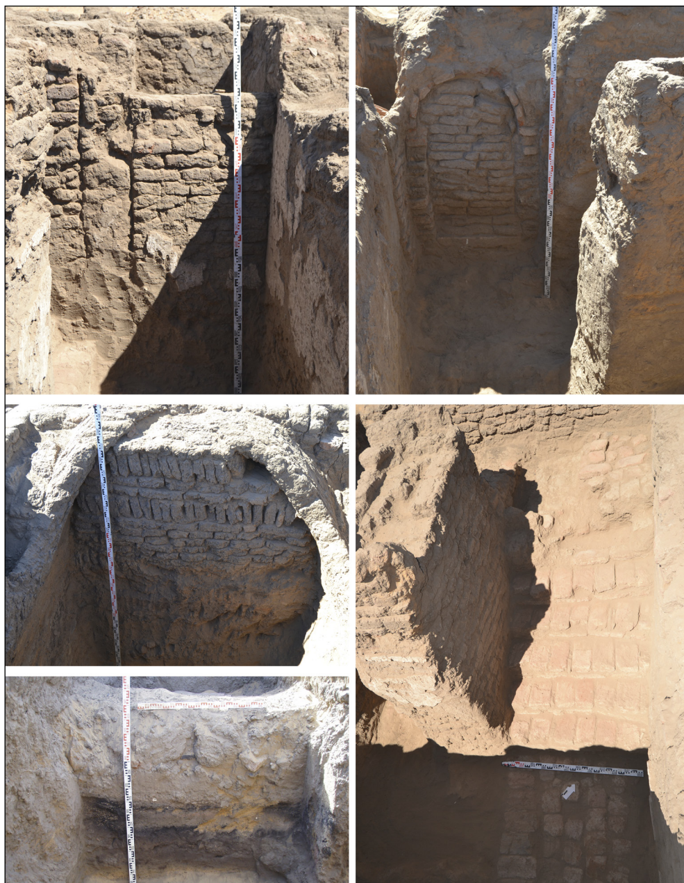
Fig. 3. House SW1: clockwise from top left, room 5, northeast wall including partition wall; room 4, door jamb on the west side; stairs in room 4; section of the fill in room 1; bricklaying course beneath the vault of room 3