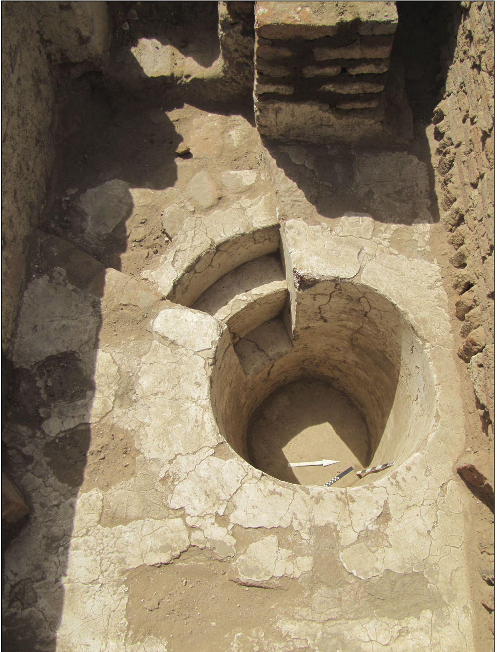
Fig. 6. Top view of the baptism tank of the Old Church