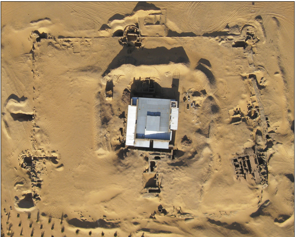
Fig. 1. Banganarti on an aerial (kite) photograph taken at the end of the 2011 season

Excavations in the Eastern Tower reached the foundation foot of the earliest tower at a depth of 4.90 m below the datum point (which is on the upper surface of the stone threshold in the southern entrance to the Upper Church) and revealed a stratigraphic record for this feature. Two general phases of building activity