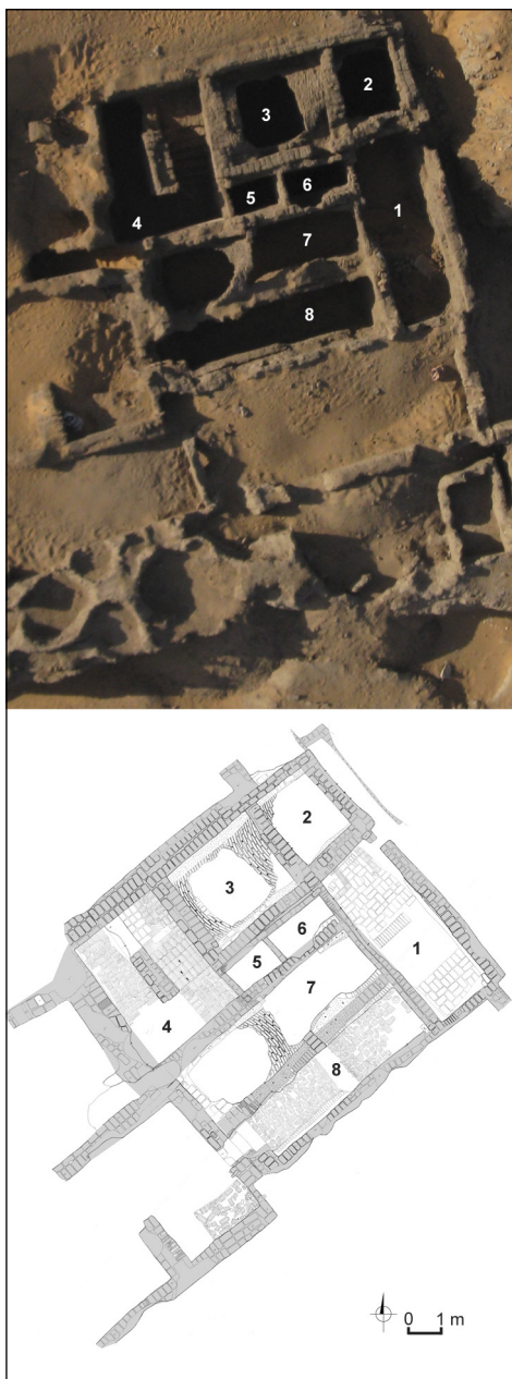
Fig. 2. House SW1: plan and top view (Drawing E. Skowrońska, K. Solarśka; aerial kite photo, early February 2011, B. Żurawski)

The original structure consisted of three rooms (1, 7, 8) and an entrance from the