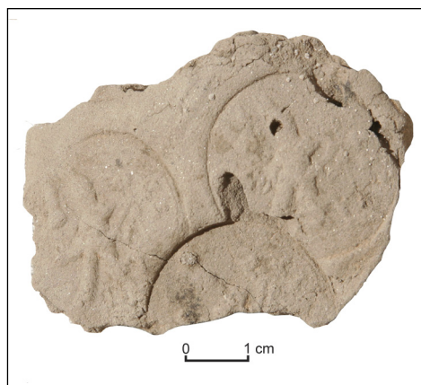
Fig. 12. Jar sealing (W.SEL2. 35/2011) with impressed image of a striding pharaoh