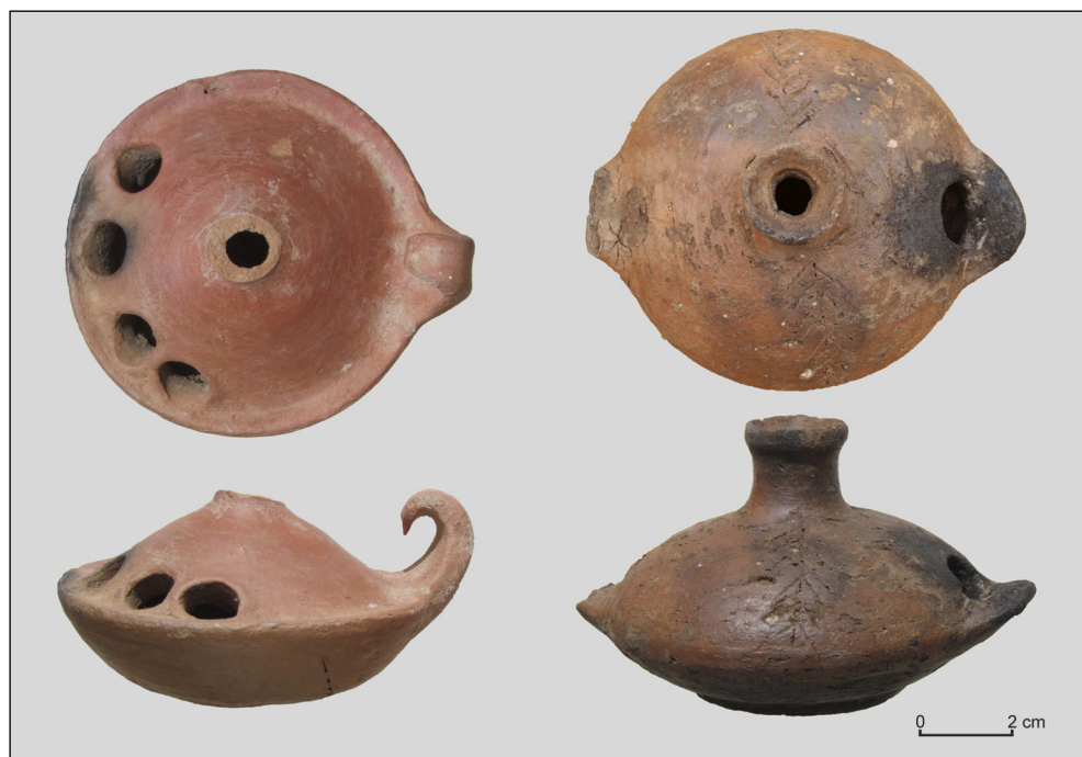
Fig. 5. Oil lamps found in between the eastern walls of the Old Church and the middle church, beneath the second apse.

Excavations in trial pit 10 in the southeastern corner of the nave of the latest church revealed the baptistery of the Old Church [Fig. 6]. It was found in excellent condition, still covered on the inside with a layer of white lime plaster. The font was approached by a set of steps on the western side. Its depth was 1.10 m, the upper diameter of the font was 0.95 m. The baptistery of the second phase of the church was located in the diakonikon, on top of the demolished southeastern corner of the earlier church.