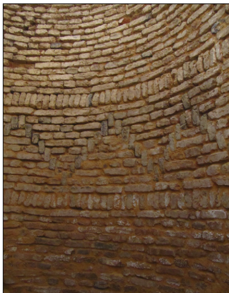
Fig. 9. Interior of the well ( matara ) at Selib with zigzag pattern of bricks in the lower part

This was done partly for the purpose of preservation of a historical monument and partly to keep the sand from blowing in again and to reduce the danger of animals and people falling into the deep hole. The reconstruction was done with the use of local materials (red brick) and mud mortar made of crushed mud brick taken from the debris heaps.