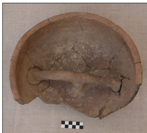
Fig. 11. Spinning bowl (SEL 63/2011)

The religious and probably also administrative centre of the Meroitic settlement at Selib 2, presumably occupying over 50 hectares, should be searched for under the conspicuous kom of Selib 3, where worked blocks have been reported within living memory.