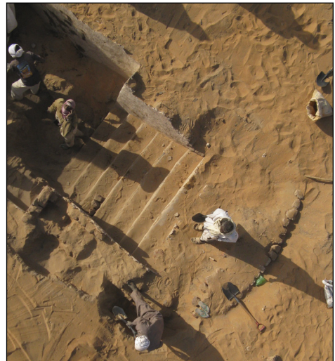
Fig. 8. Subterranean tank: left, bird's eye view of the steps leading to the basin during exploration

The complex evidently had some function associated with the use of