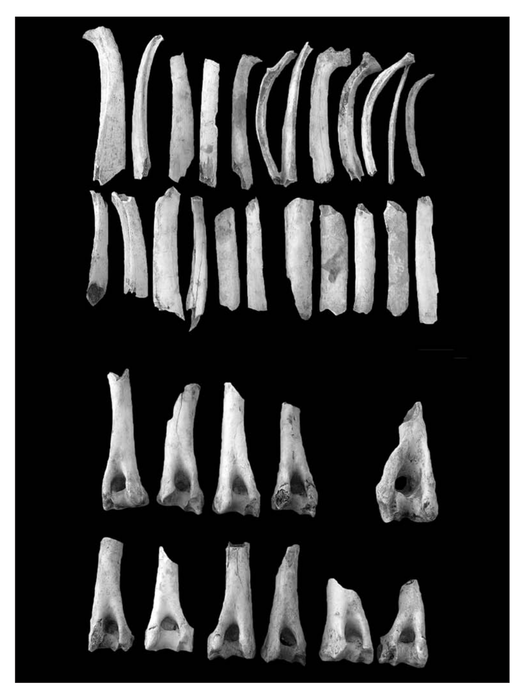
Fig. 3. Damage resulting from carcass division: ribs (top) and humerus of sheep, goat and pig