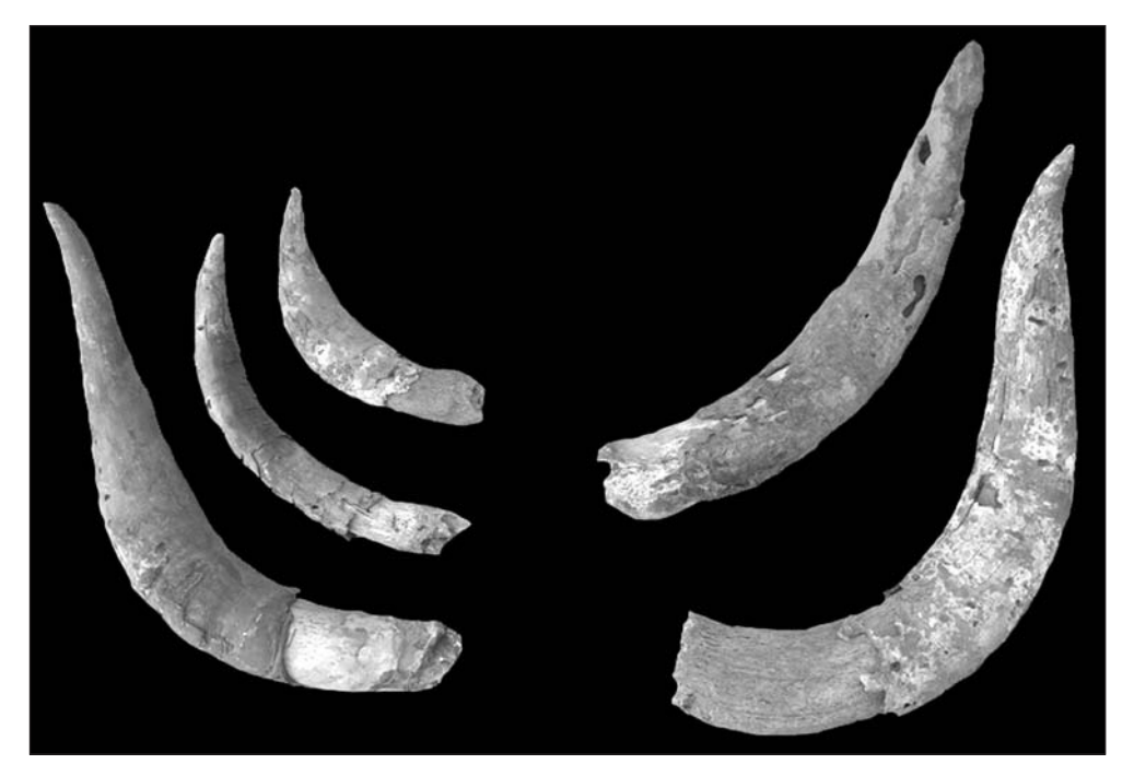
Fig. 2. African sanga cattle horns showing clear sexual dimorphism in the shape

The absence of distinctive features made it impossible to determine the morphotype of other domestic breeds, the remains of which were recorded in the palace