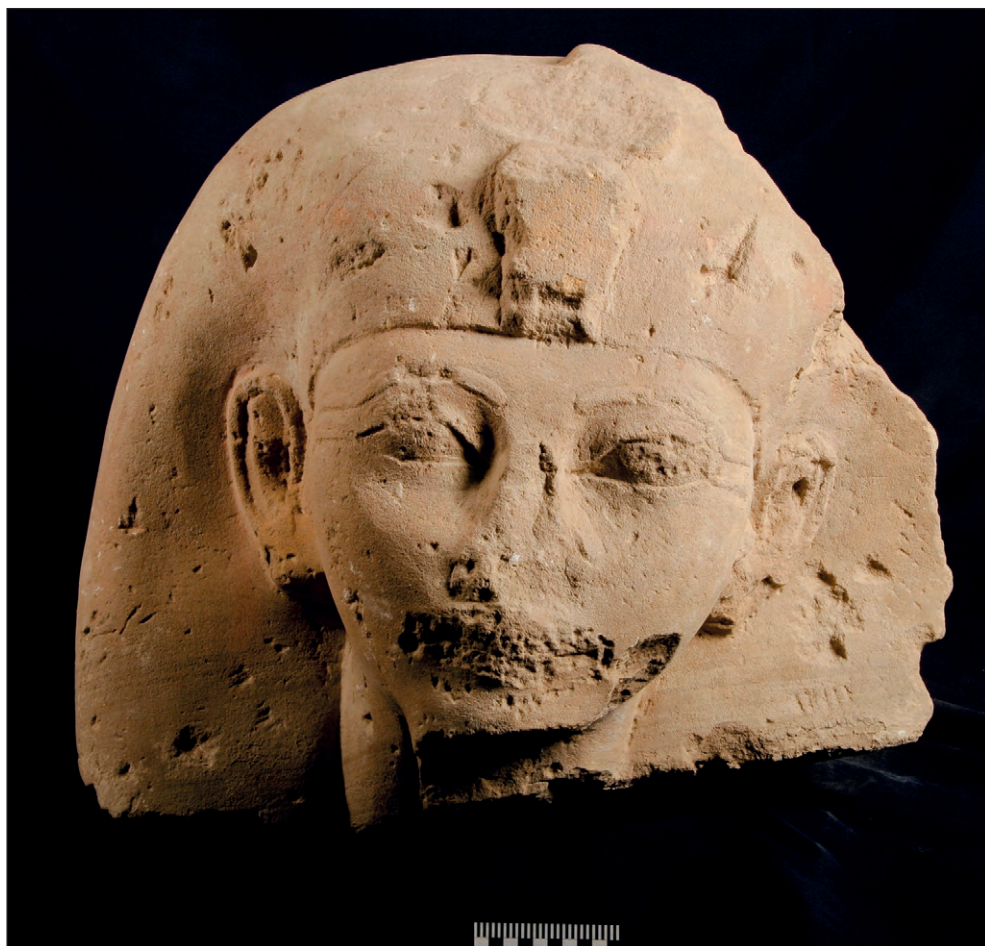
Fig. 1. Winlock's Head F, current state of preservation after dry cleaning

Originally there were about 60 statues along the Causeway leading from the Bark-Station halfway from the Valley Temple to the Upper Temple's Main Gate and another 12 to 14 sphinxes in its Lower Court, the average distance between successive statues being 15.50 m (Hauser Notes ).