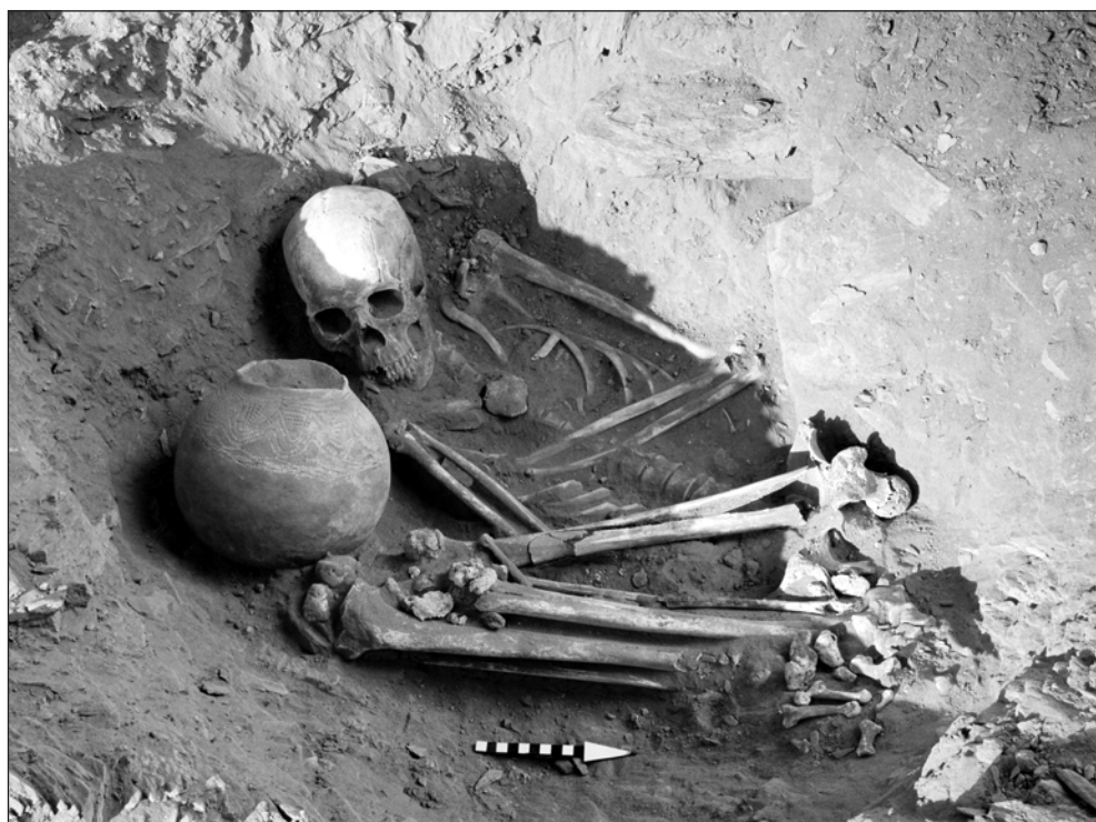
Fig. 1. Late Meroitic tomb T.12 at the El-Ar P1 site

Fragments of at least three caliciform beakers found scattered on the surface of