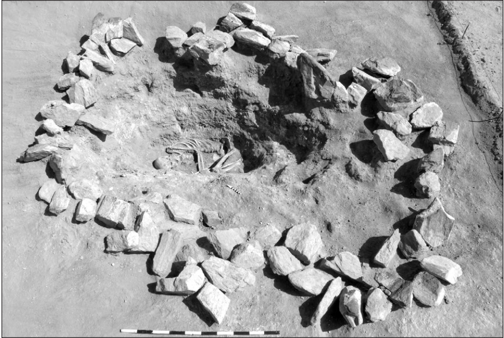
Fig. 3. Site P37 during excavation