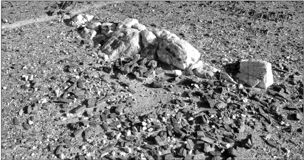
Fig. 4. Site P38 before excavation