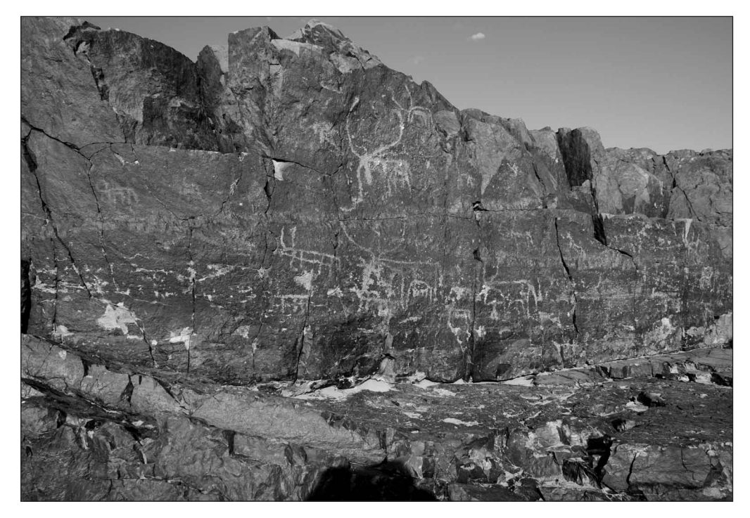
Fig. 4. Close-up of part of the rock art "gallery" at the Keheili 5 site