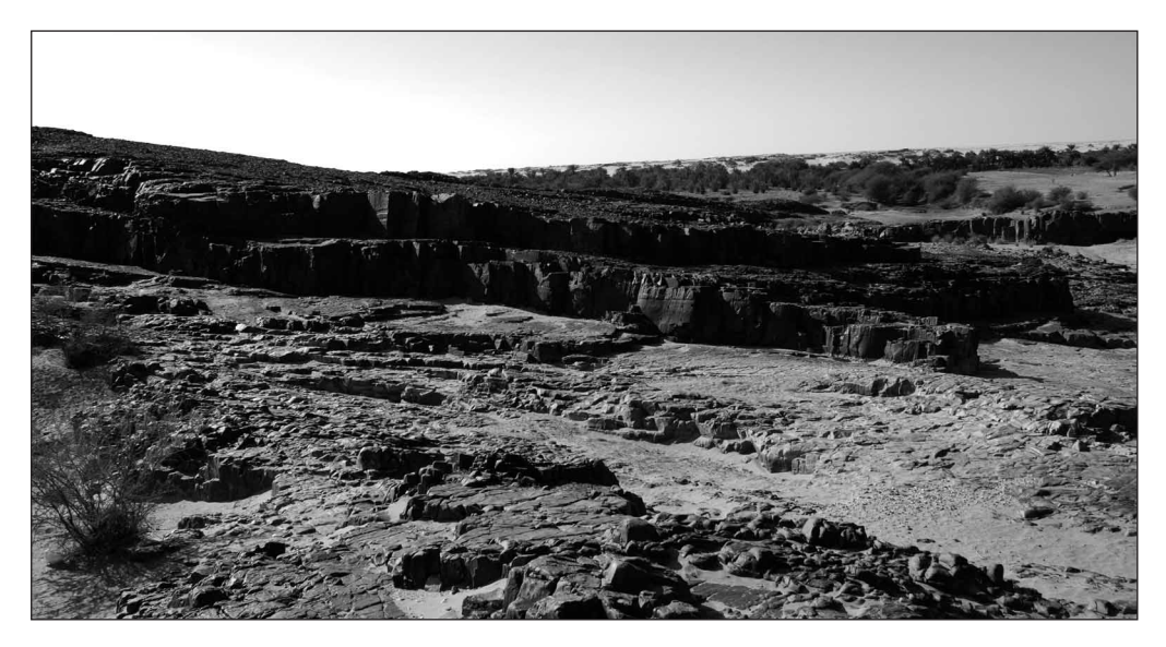
Fig. 3. Rock art "gallery" at the Keheili 5 site