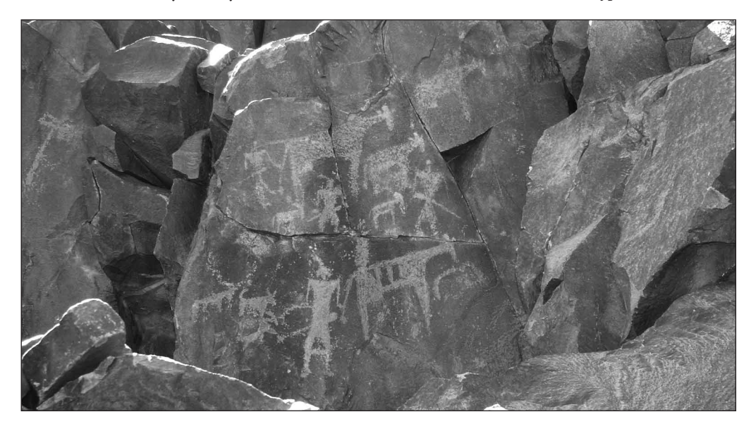
Fig. 2. Rock art panel from the "gallery" at the GM67 site