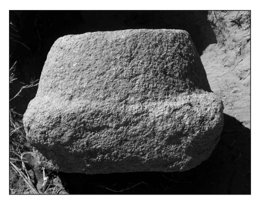
Fig. 1. Sandstone capital from the ruins at site GM52

Two or three late Meroitic/post-Meroitic cemeteries were discovered: GM14 (recorded in February 2007 by ethnographer P. Maliński