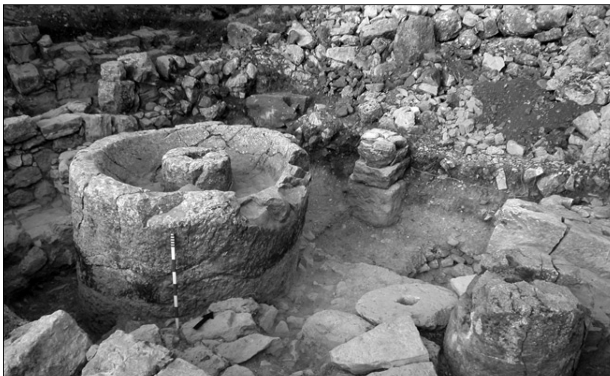
Fig. 6. Oil press E.III. Trapetum seen on the left