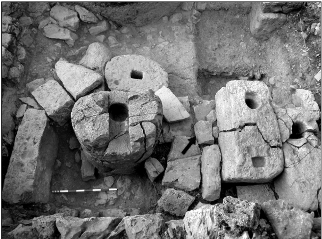
Fig. 8. Oil press E.III. On the left, cylindrical weight anchoring the wooden screw belonging to the southern press installation

A street appears to have separated the cistern from the oil press. It was constructed already after the cistern was in place (its northern edge is supported in part on the cistern), leaving no doubt as to