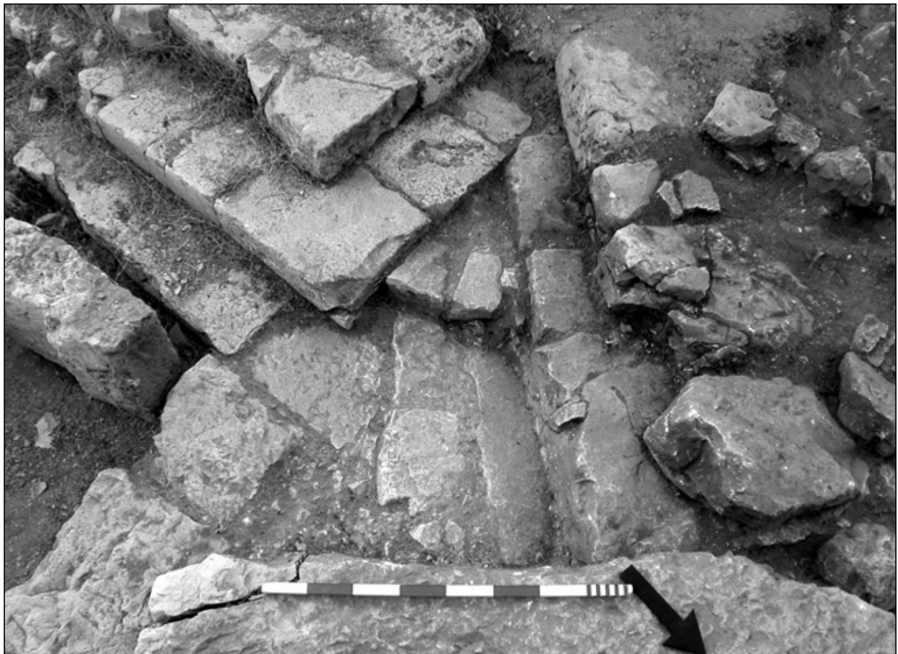
Fig. 4. Corner of the temple steps on the left and steps leading to the village exit gate

The other area in sector X inside the sanctuary where some verificatory archaeological work was completed this season was ensconced between the north wall of the temple pronaos and the south wall of room E.V. Blocks used in Late Antiquity to raise the floor level here were now dismantled, revealing pieces of crushers from an oil press. Three stone steps were also uncovered, lying in a line with the steps