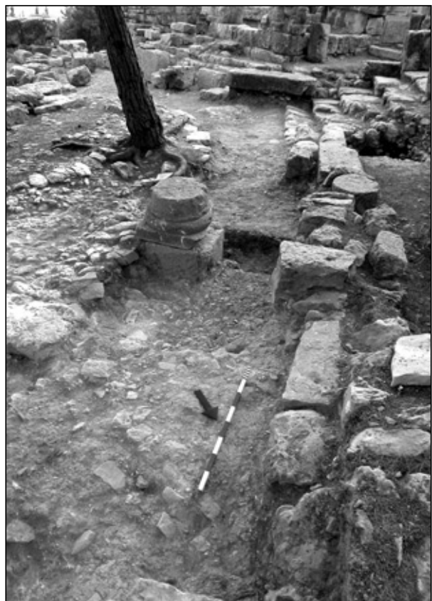
Fig. 3. Roman structures uncovered during the dismantling of a Late Antique platform in the northern part of the temenos

Sector X in the northern end of the sanctuary covered an area just by the walls of houses E.XII and E.XIII, where an existing basin adjoining the wall was taken advantage of to check the stratigraphy down to bedrock. This was encountered 0.40 m below the floor of the basin. A layer of brown compact soil immediately under the bedding layer of the basin contained pottery