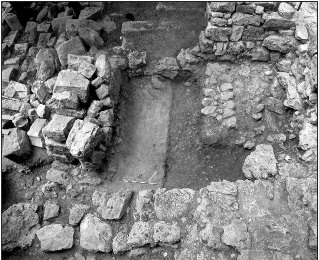
Fig. 2. "Tower" D. Early structures exposed in 2005

and chronology are concerned. Trenches dug in 2004 along the south wall and the southeastern corner of this structure, against which Basilica B was constructed in a later age, dated its walls to the 3rd century AD. 2 The alterations introduced inside the building by the builders of the basilica have all but obliterated the inner divisions from the Roman age. The only evidence were the rock-cut foundation trenches discovered in