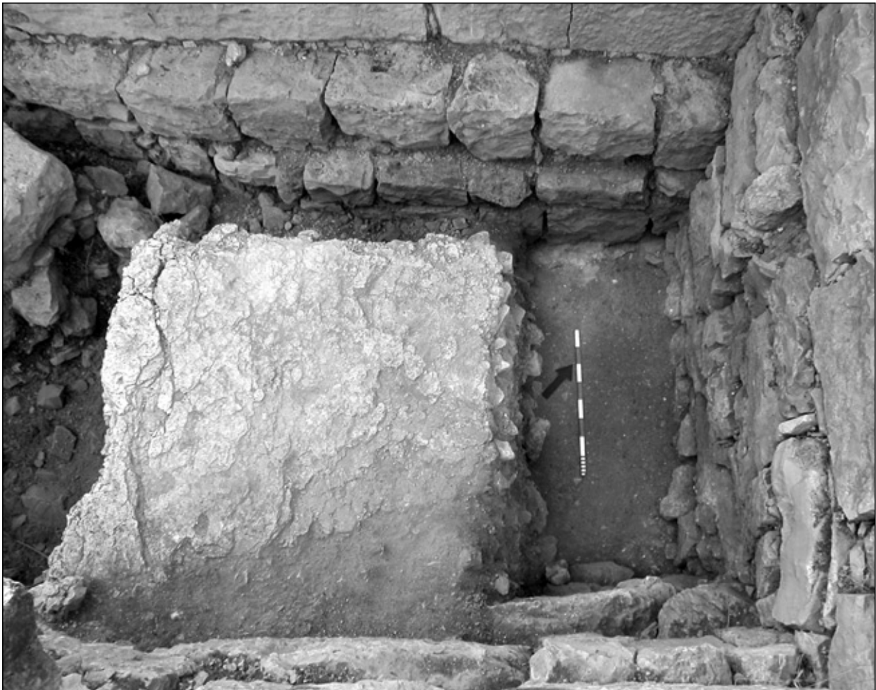
Fig. 5. Test pit in the pronaos of the Roman temple. Lime floor of the 1st century AD in the middle, north temple façade wall seen at top

The task of clearing the cistern by the north wall of the temple (C.VI) was