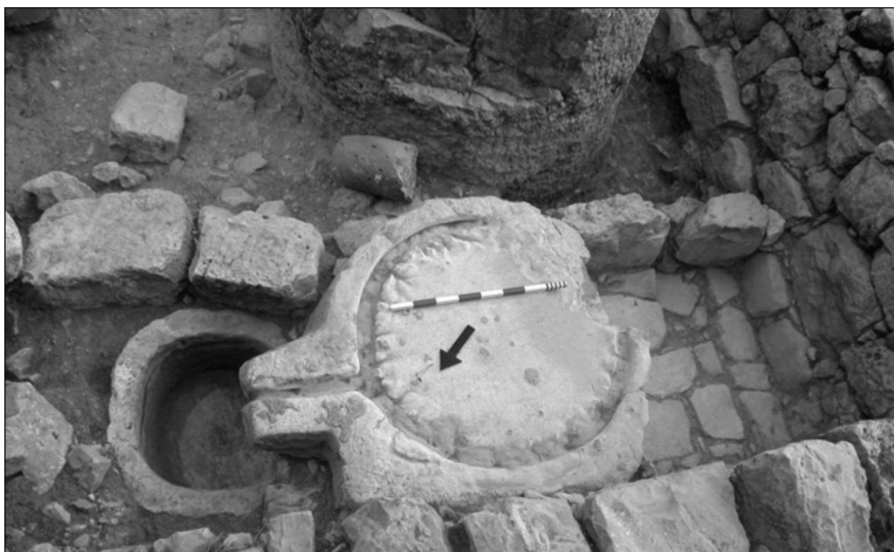
Fig. 7. Oil press E.III. Press bed and basin for the oil belonging to the northern press installation