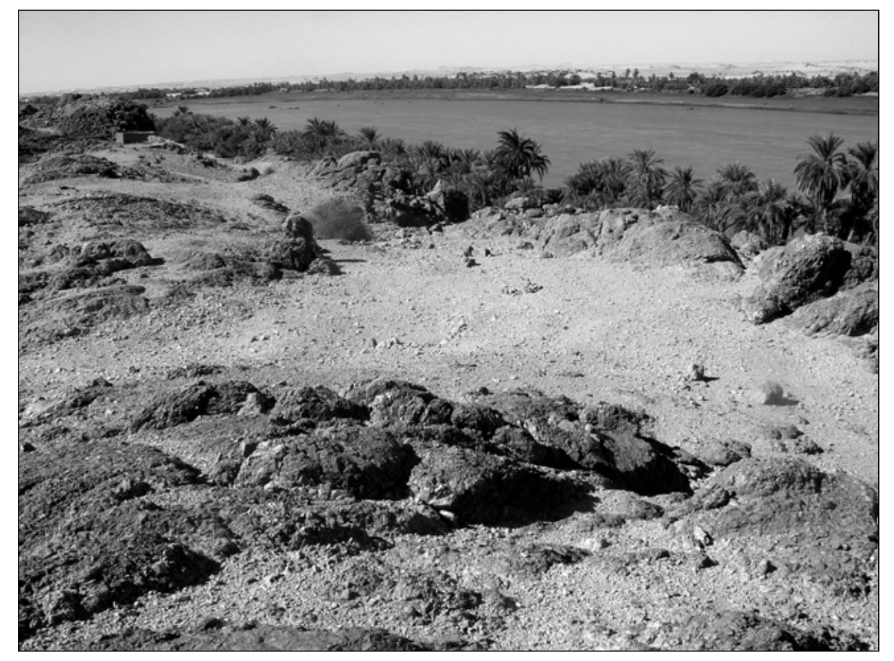
Fig. 2. Es-Sadda 28. Neolithic settlement