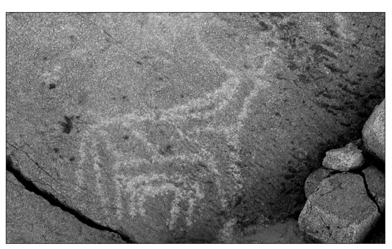
Fig. 6. El-Gamamiya 13. Rock drawings