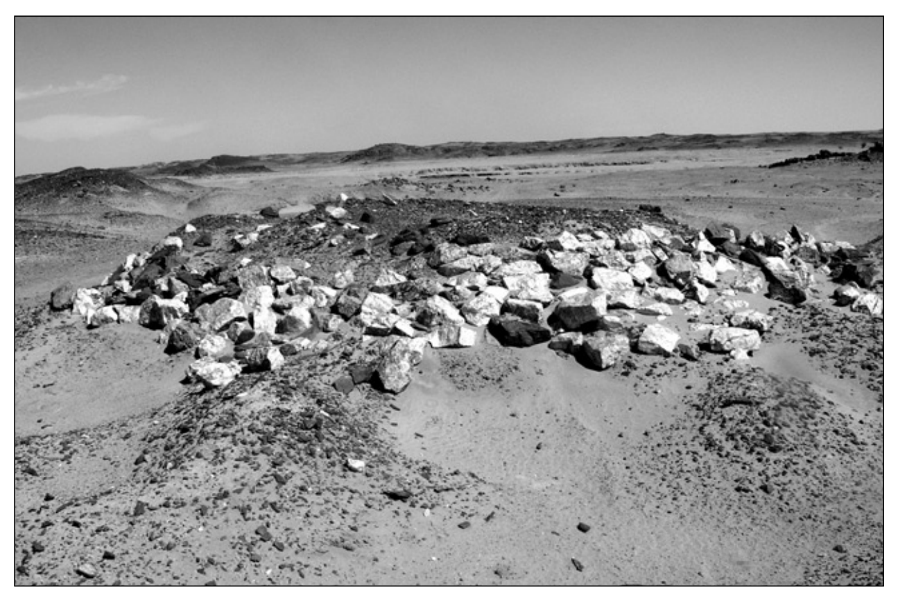
Es-Sadda 24. Tumulus cemetery Fig. 1.