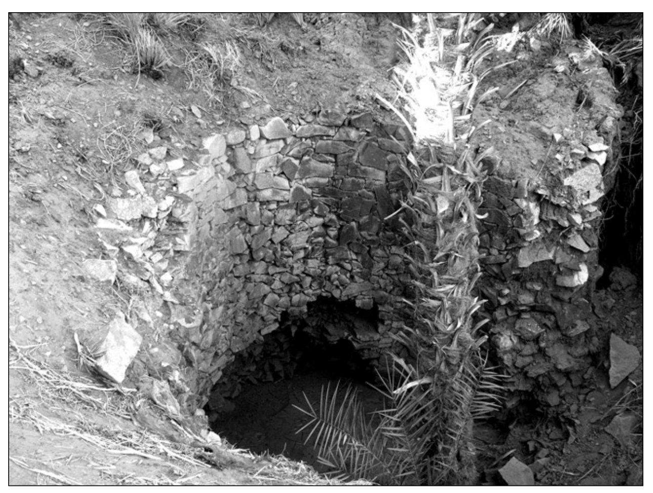
Fig. 4. El-Gamamiya 7. Saqiyah