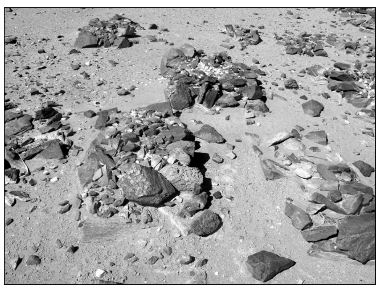
Fig. 8. Shemkhiya 17. Box-graves cemetery