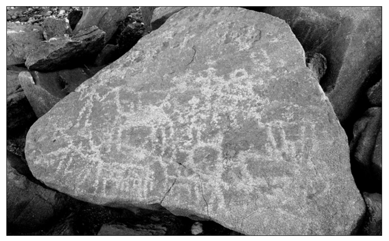
Fig. 7. El-Gamamiya 13. Rock drawings