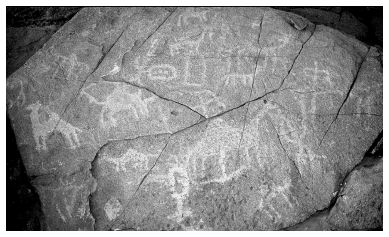
Fig. 5. El-Gamamiya 13. Rock drawings

The tumuli burial fields on hilltops are in all likelihood of Kerma-horizon date. All of the tombs were built of stone blocks and are about 3 m in diameter.