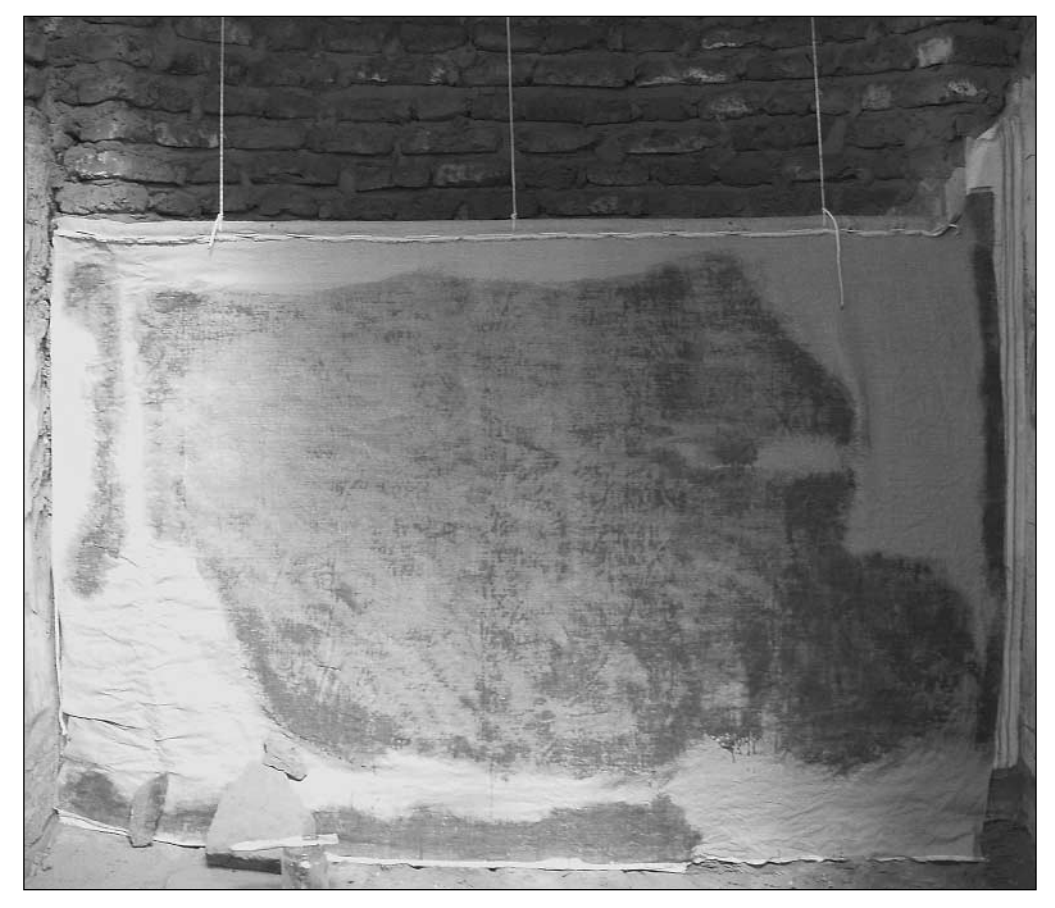
Fig. 1. Chapel 5. Later painting with complete facing, suspended from the ceiling

Other uncovered paintings were also subjected to preservation treatment, paralleling to some extent work carried out in earlier seasons.<sup>1</sup>