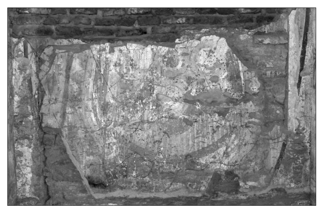
Fig. 2. Chapel 5. Later painting in situ