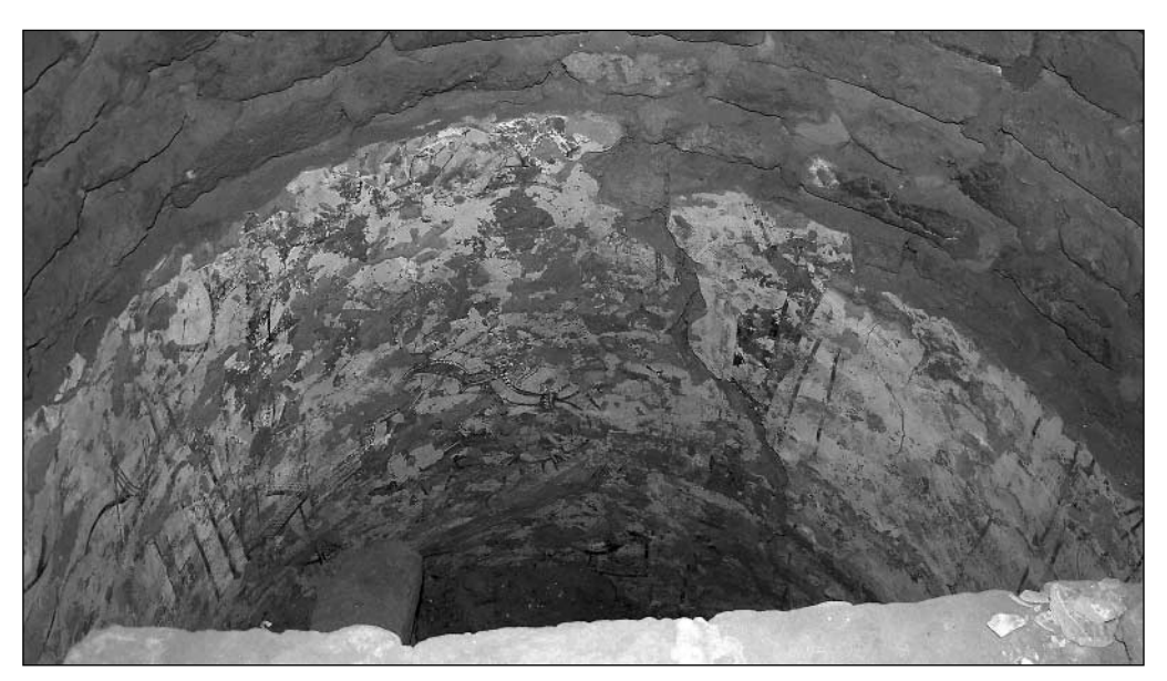
Fig. 6. Chapel 6. During the dismantling of the blocking wall: later painting with partial facing and the earlier painting uncovered