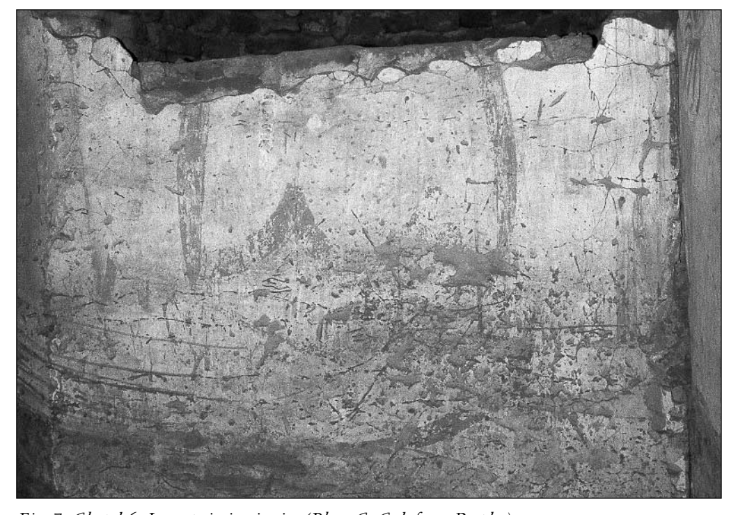
Fig. 7. Chapel 6. Later painting in situ