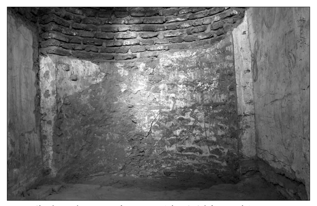
Fig. 3. Chapel 5. Earlier painting after uncovering