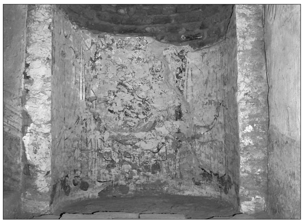
Fig. 8-9. Chapel 6. Earlier painting after cleaning and infilling of the gaps and detail (below)