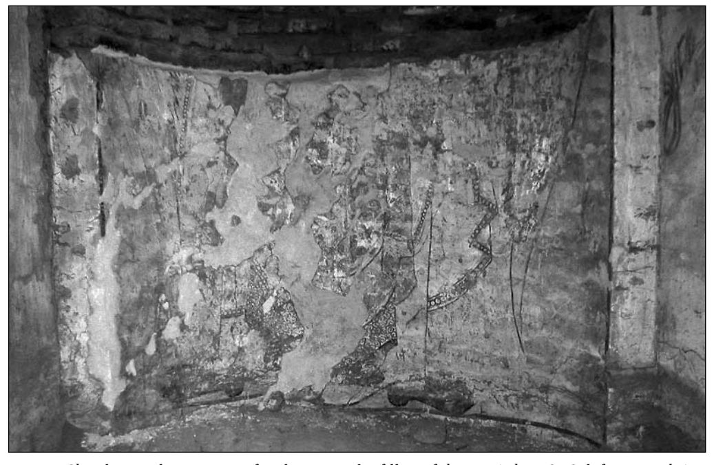
Fig. 5. Chapel 5. Earlier painting after cleaning and infilling of the gaps