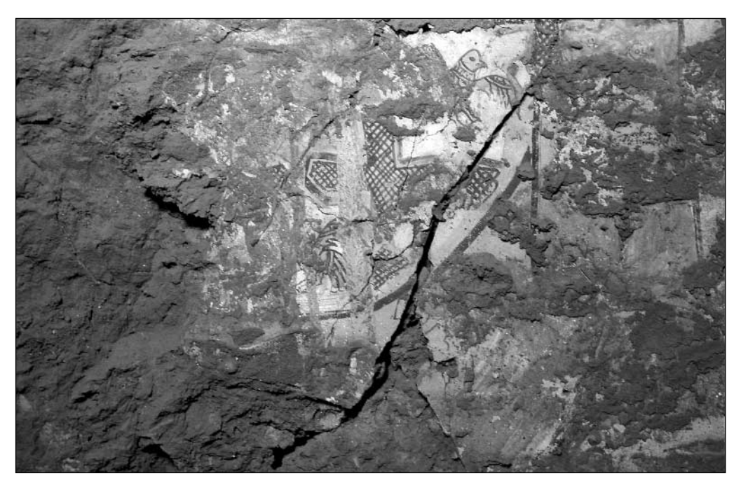
Fig. 4. Chapel 5. Earlier painting after uncovering detail