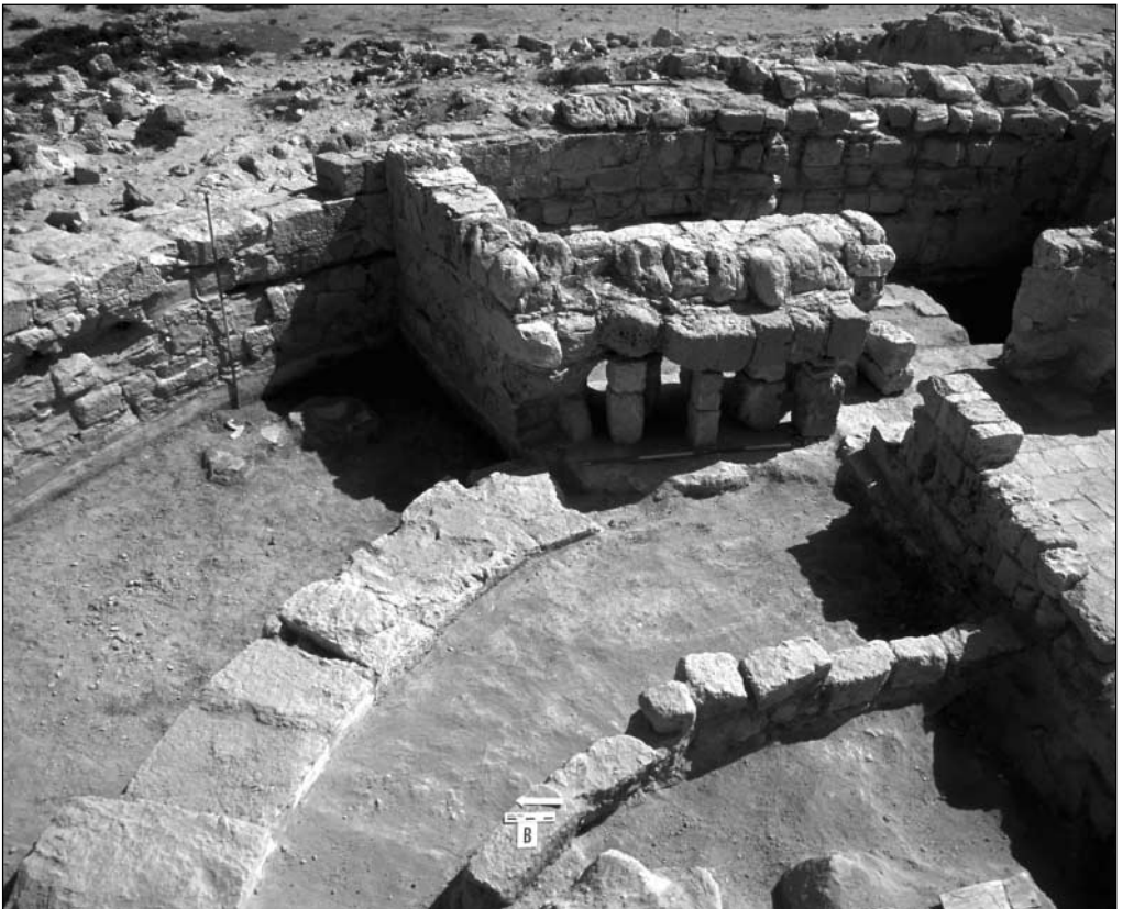
Fig. 10. Basilica. The northern wing of the transept after exploration. View from the west

Three massive buttresses that had been recorded on Grossmann's plan on the outside of the apse wall were now cleared. Yet another buttress supported the wall of the northern aisle of the basilica (see Fig. 3 ).