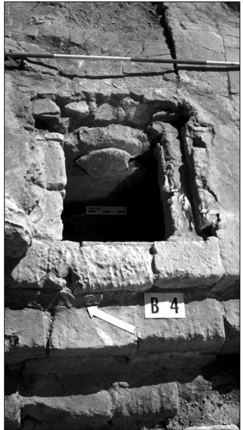
Fig. 7. Crypt no. 1 in the apse with a slab closing the entrance. View from the west

form made of lime mortar, now cracked. A crypt was found on either side of the axis of the apse. In both cases, the depth of the crypt reached 1.80 m. One of these crypts (no. 1; marked as a in Fig. 4) preserved a stone vault and a slab closing the entrance from the west (Fig. 7). The other ( b in Fig. 4) contained the collapsed stones of a similar vault. There were multiple burials in both of the crypts. Pieces of rotten wood found with the bones indicated the presence of some kind of wooden coffins. Since the tombs had been