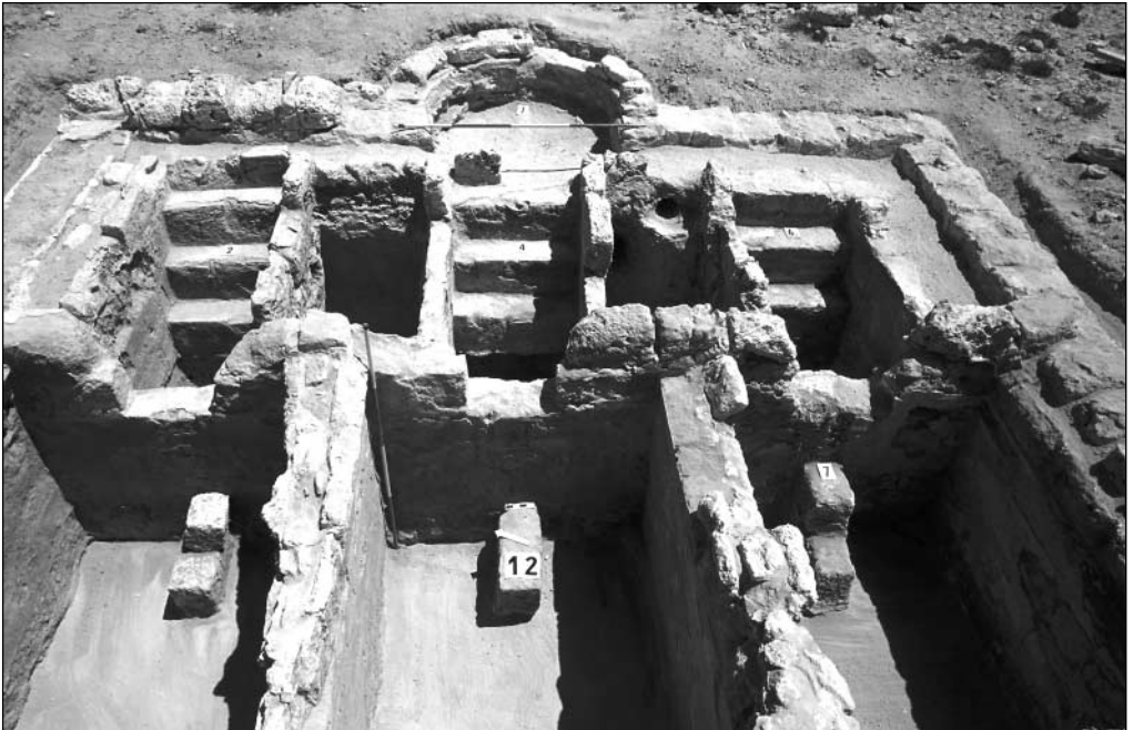
Fig. 2. Funerary chapel. View from the west

Sets of three steps each, discovered respectively in rooms 2, 4 and 6, led to the tombs ( Fig. 2 ). For reasons that remain unclear, these rooms were further partitioned – cross walls were discovered separating room 3 from 2 and 5 from 6. In the wall opposite the steps, there were three openings through which bodies of the newly dead