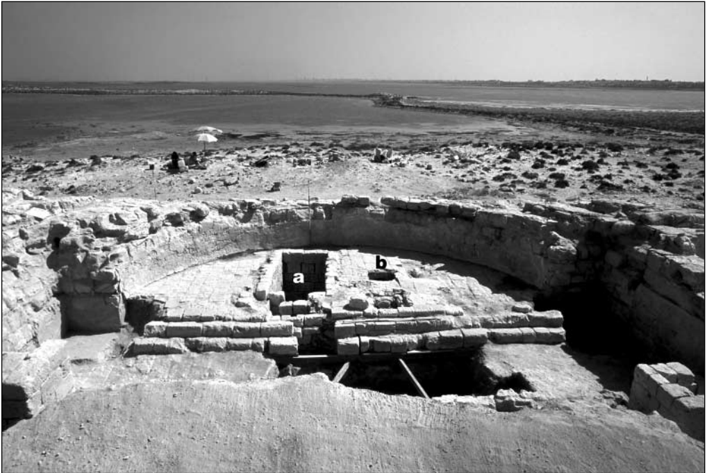
Fig. 4. Basilica. View of the apse and the crypts after clearing