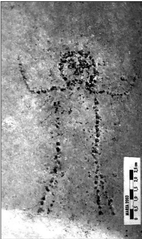
Fig. 8. Marble column shaft with sgraffito of an orant

22 cm. The biggest shafts, carved from a gray, striped marble, must have originally stood in the nave; the lesser ones presumably supported the ciborium above the altar or else constituted some architectural elements difficult to reconstruct today. The two Corinthian capitals that were discovered once topped columns of average size. The interior decoration of the basilica also included engaged columns of stone with Corinthian capitals of unpainted stucco. Numerous pieces of stucco were brought to light while removing the debris from the southern end of the apse.