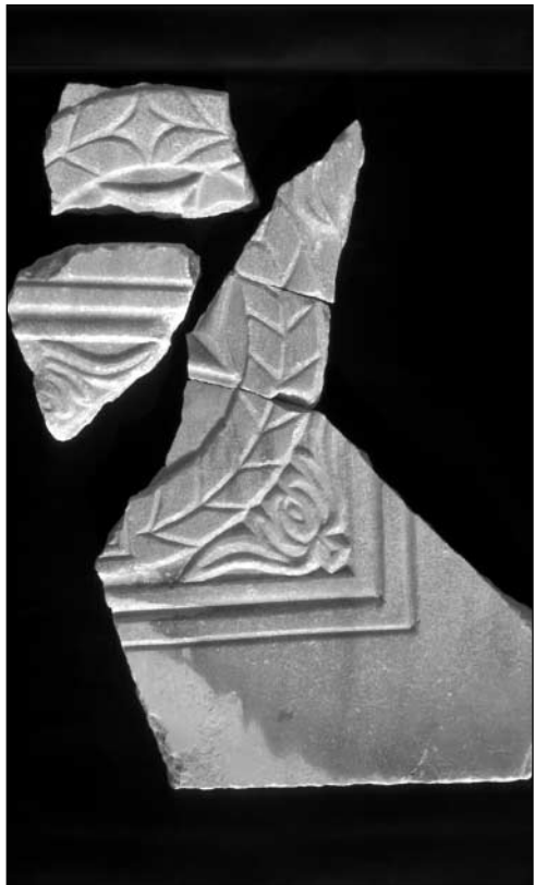
Fig. 9. Fragment of screen with a cross from the cancelli of the church