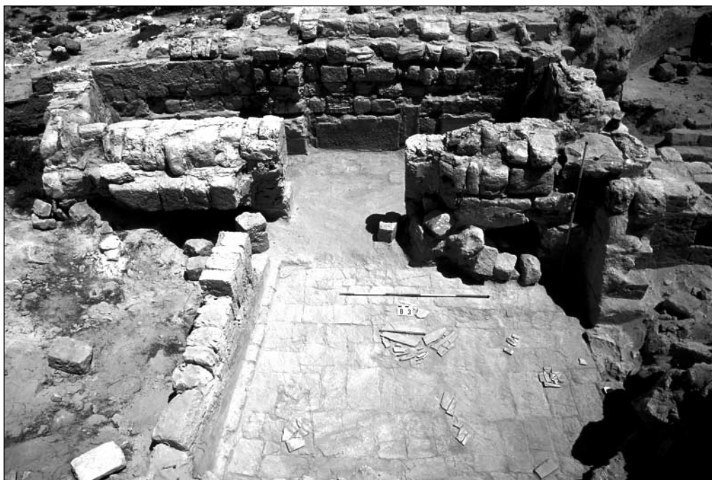
Fig. 5. Basilica. The inner pastophorium. View from the west