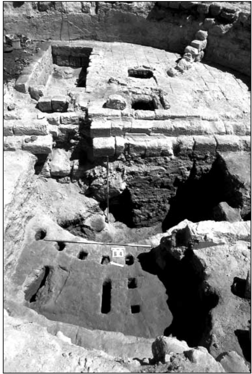
Fig. 11. Basilica. In the foreground, the amphora kiln discovered under the apse

of the kiln and the time when the basilica started being constructed. The kiln is thus proof of a flourishing wine-manufacturing center existing on the site before the foundation of the Byzantine town. The wine was packed in locally-made amphorae and sent to other cities of the Graeco-Roman world. One of the sherds from the debris filling the kiln featured a stamp with the name of the owner of the vineyard - Dionisiou.