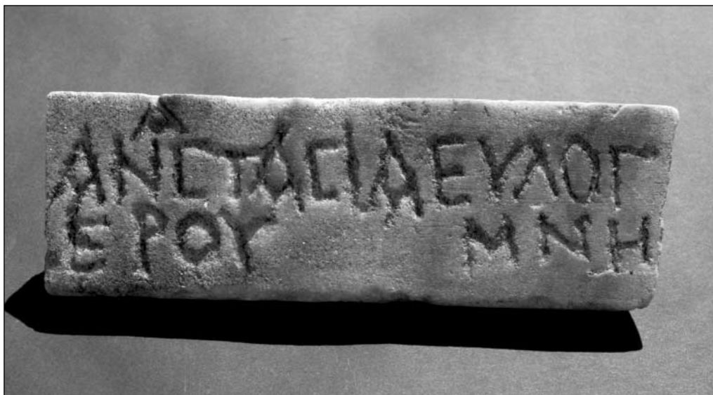
Fig. 6. Marble tile bearing a Greek inscription