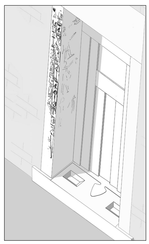
Fig. 2. Reconstruction of the offering place in Chapel 10, showing the position of jamb S/01/20 (Drawing K. Kuraszkiewicz)

The text can now be reconstructed as follows:<sup>7)</sup>