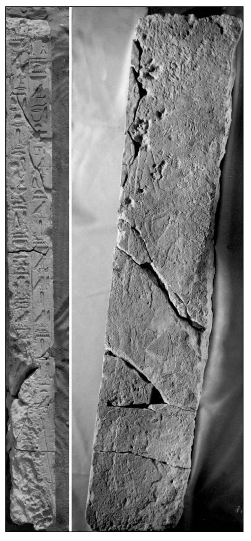
Fig. 1a. The frontal and lateral side of the jamb with recently found elements fixed in place

These observations make the composition of the text quite clear. The preserved part of the self-laudatory text consisted of three parts: an epithet, followed by two autobiographical sentences and a title, which most probably preceded the name of the deceased. Although it may not be excluded that the text began on the lintel, this eventuality seems less probable, as lintels usually received separate decoration. <sup>6)</sup>