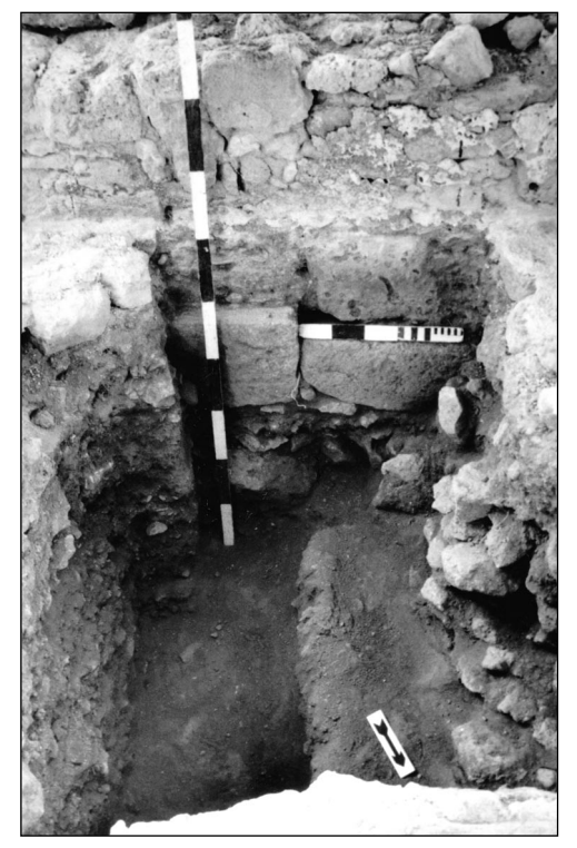
Fig. 2. Villa of Theseus. Pit in the southeastern part of Room 76. View from the north

Excavation continued in the eastern part of the pit along the foundation. The layer of brownish soil and some gravel contained sherds of Attic black-glazed ware, fragments of Color-Coated Ware and, at a depth of about 0.65 m, a Rhodian amphora handle with a stamp bearing the