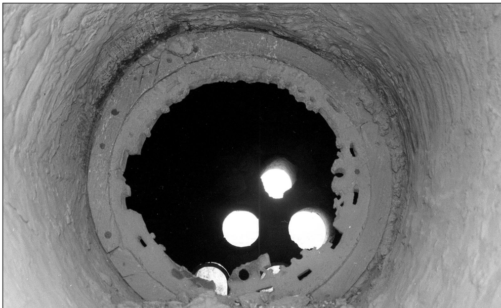
Fig. 5. Qubba. Northwestern outer wall. Oculus in the transitional zone of the dome. Relics of the original qammariyya