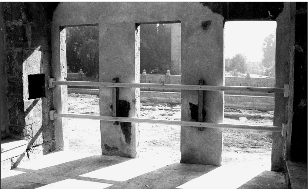
Fig. 2. Khanqah. Upper floor of the southeastern outer wall. Safety balustrade viewed from the interior