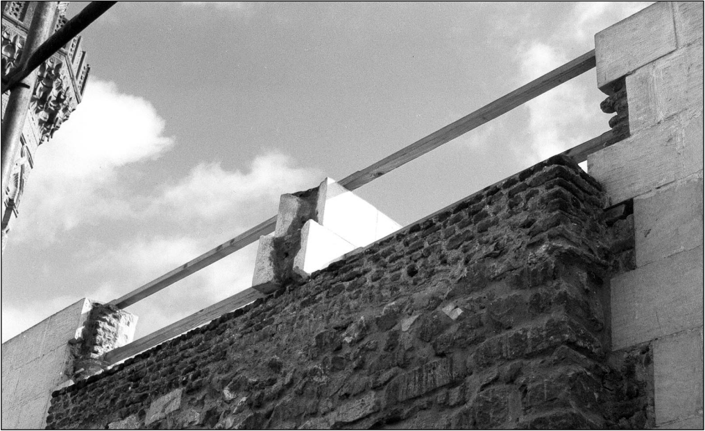
Fig. 1. Khanqah. Upper part of the northwestern elevation crowned with a safety balustrade between newly reconstructed Mamluk-like sections