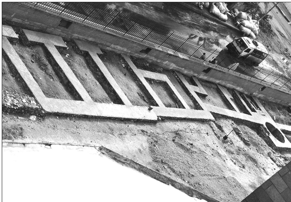
Fig. 9. Rab'a. Uncovered foundation courses of habitation units. State during preservation works. View from the roof of the madrassa

preparation for this stage, the mission has conducted some preliminary studies of the madrassa and mausoleum. A preliminary mineral and petrographic investigation was carried out in 2000, the results to be used for technical purposes at a later stage of building-conservation works.