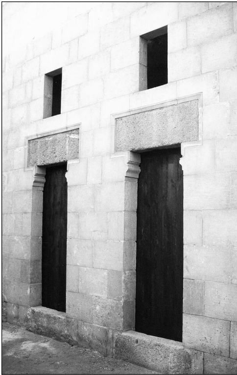
Fig. 3. Khanqah. Lower part of the restored northwestern elevation. Two entrances leading to the separate residential units. State after mounting the wooden shutters

wooden balustrades and safety grasps, installed along the top of the outer walls of the entrance facade (northwestern). In view of the fact that parts of the reconstructed wall, having received the form of Mamluk times, were now raised in certain sections of the facade, the level of the balustrades was also varied accordingly. Between the “Mamluk” stretches, a double-level balustrade, 1.10 m high for adults and 0.60 m for children, was installed ( Fig. 1 ). A similar principle was followed along the