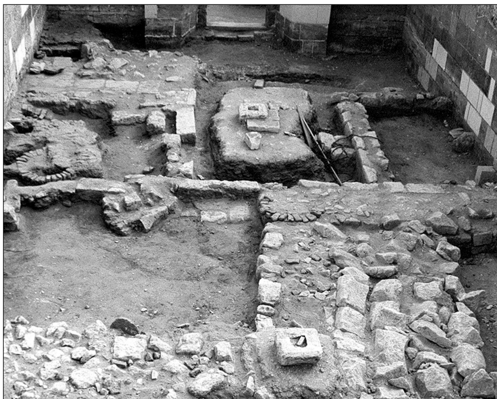
Fig. 7. Tabuna. Eastern building. General view of the architectural discoveries made during excavations in 2000

Ottoman period, which is to be reconstructed in the future. The outer walls of the structure, especially the tops, were reinforced to support the thrust of the wooden ceiling, which was reconstructed based on research and parallels (Fig. 8). Detailed attention was devoted to the zone bordering the court of Guirbash Qashuq, the so-called hawṣ , where in the north-western corner of the tahuna a reconstruction of the window opening of the old sabil was executed. This part of the tahuna is being reconstructed to serve as a stuccowork workshop producing reconstructed qammariyyat for mausoleums and madrasas of the Northern Cairo Necropolis.