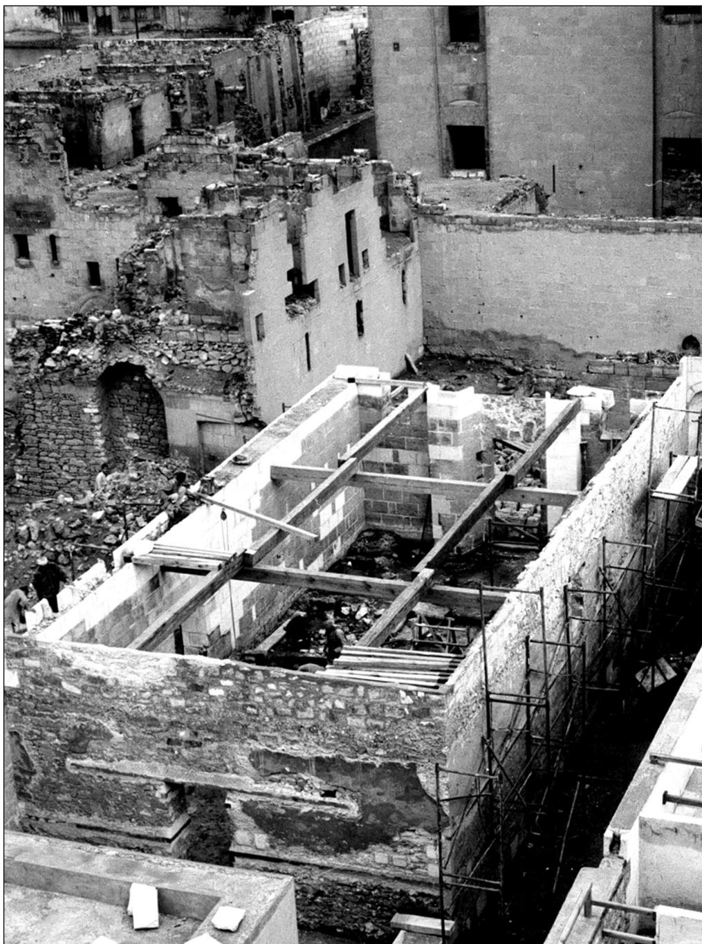
Fig. 8. Tabuna. Eastern building. The main structural timbers. State during roofing works