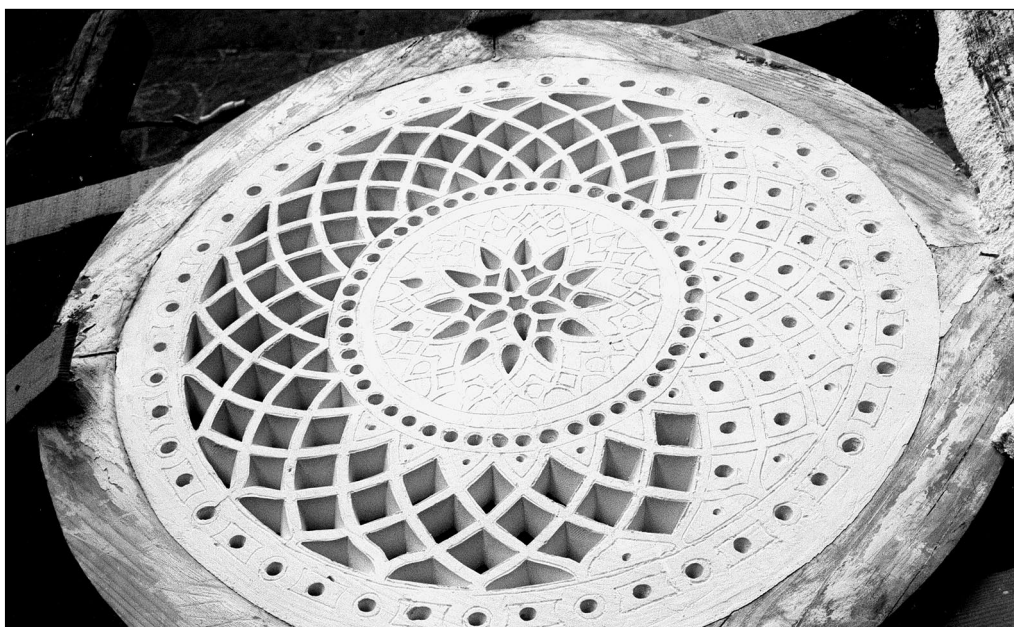
Fig. 6. Qubba. Qammariyyat workshop. Detailed view of a round qammariyya being prepared for the oculus in the mausoleum dome