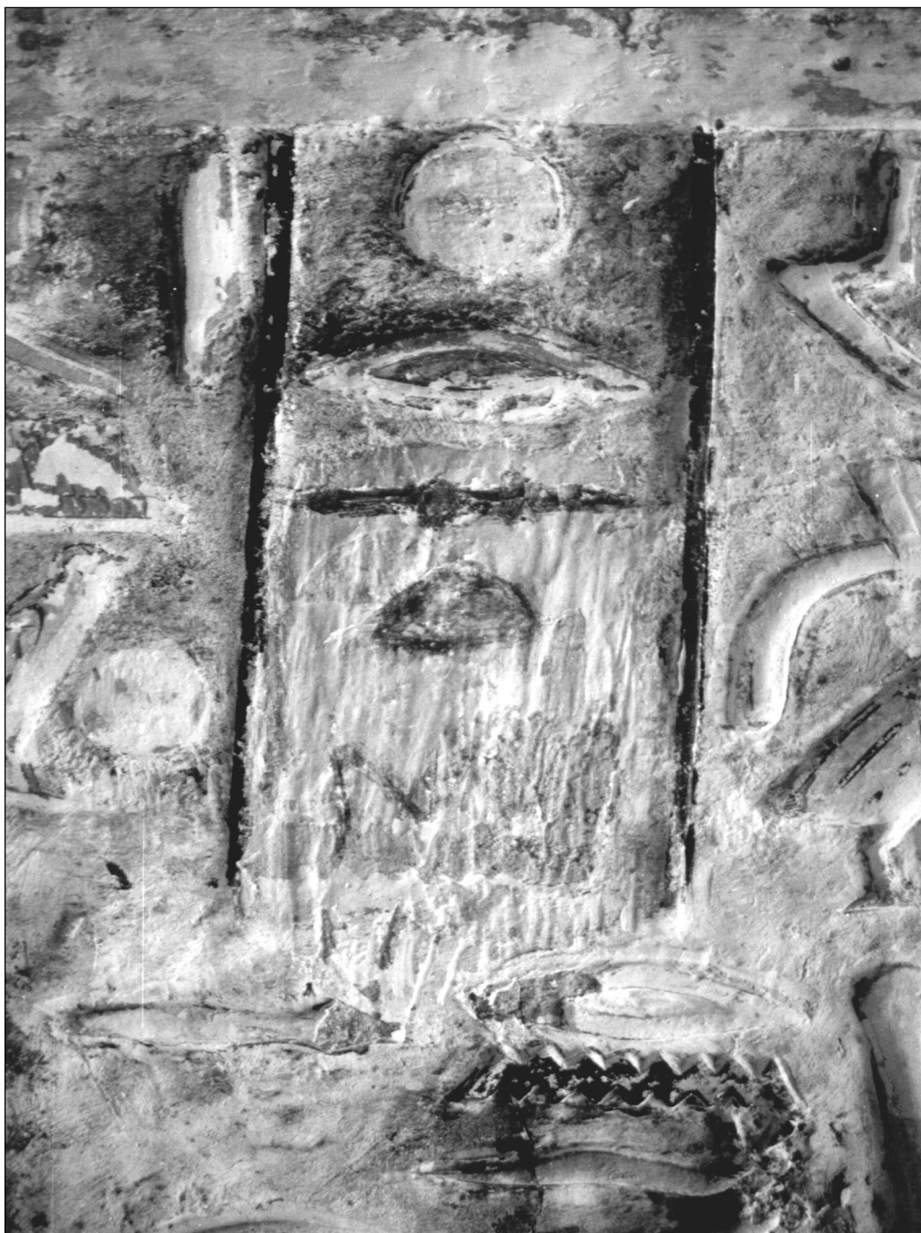
Fig. 4. Fragment of the inscription in scene 25: the chiseled out word nswt in the formula im3hw hr... and the word smit painted in its place