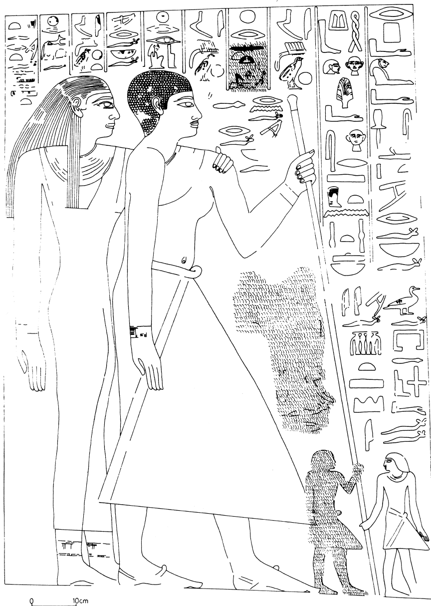
Fig. 3. Copy in drawing of scene 25 on the southern wall of the entrance to the chapel (Drawing K. Kuraszkiewicz)