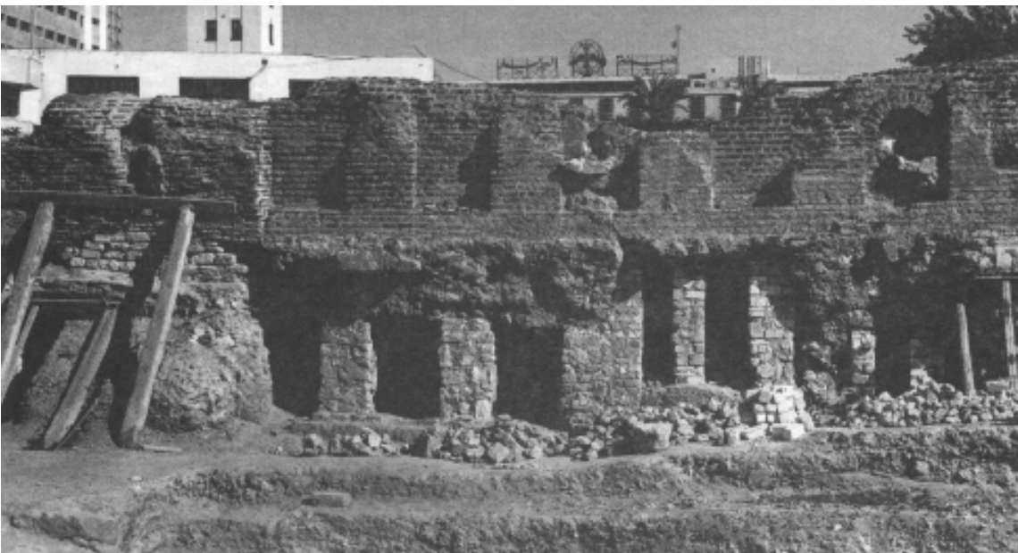
Fig. 2. Northern facade of the cistern.