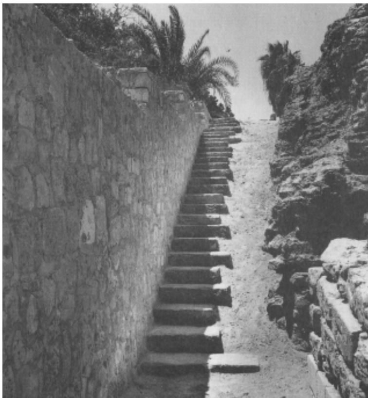
Fig. 3. New stairs and revetment wall at the southern edge of the cistern.

Clearing of the northern facade of the cistern in 1995/96 had revealed a dangerous overhanging of the upper parts of this elevation. Almost the entire length of this facade (c. 50 m 2 ) was cleared this year, providing visible proof of the fact that practically the entire cistern complex stands on top of