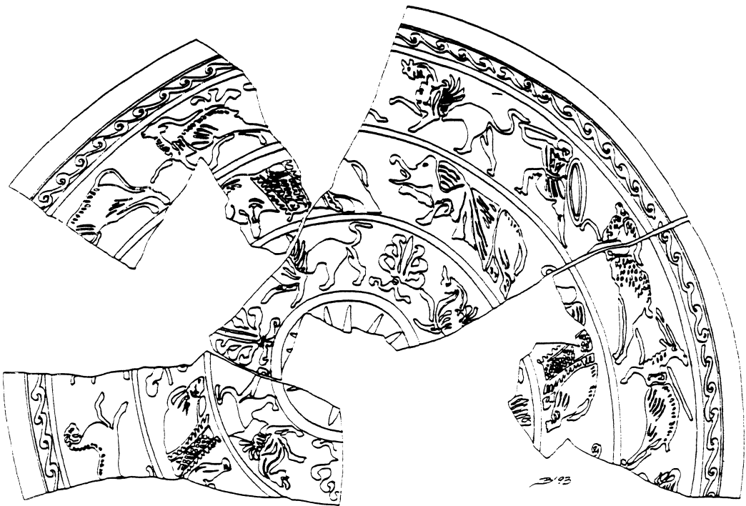
Fig. 2. Decoration of the inner face of a faience bowl from Athribis (TA 93/31p). Drawing K. Baturo.