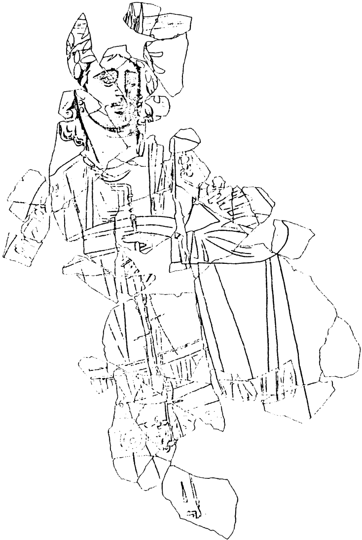
Fig. 2. House of Aion, Room 7. Reconstructed fragment of painted wall decoration.