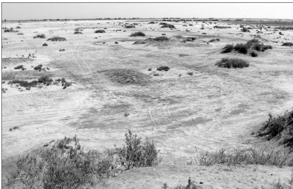
Fig. 3. Southeastern part of the prospected area, view from the south