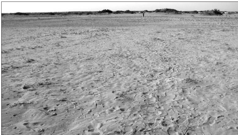
Fig. 2. Northern part of the prospected area, view from the north